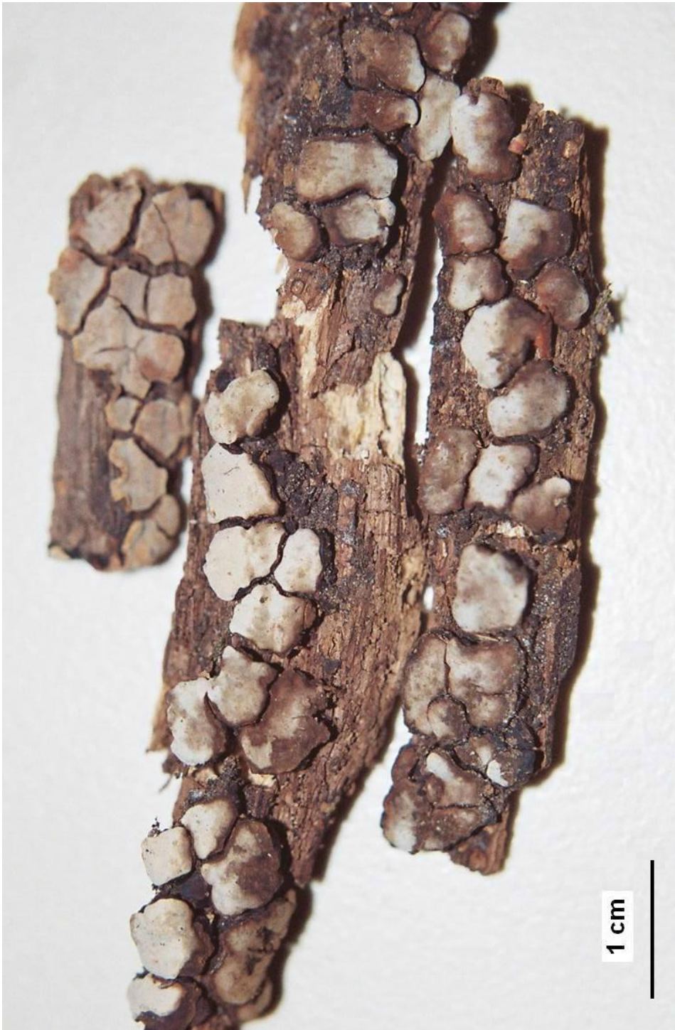
Fig. 1. Xylobolus frustulatus in Sośnica reserve.