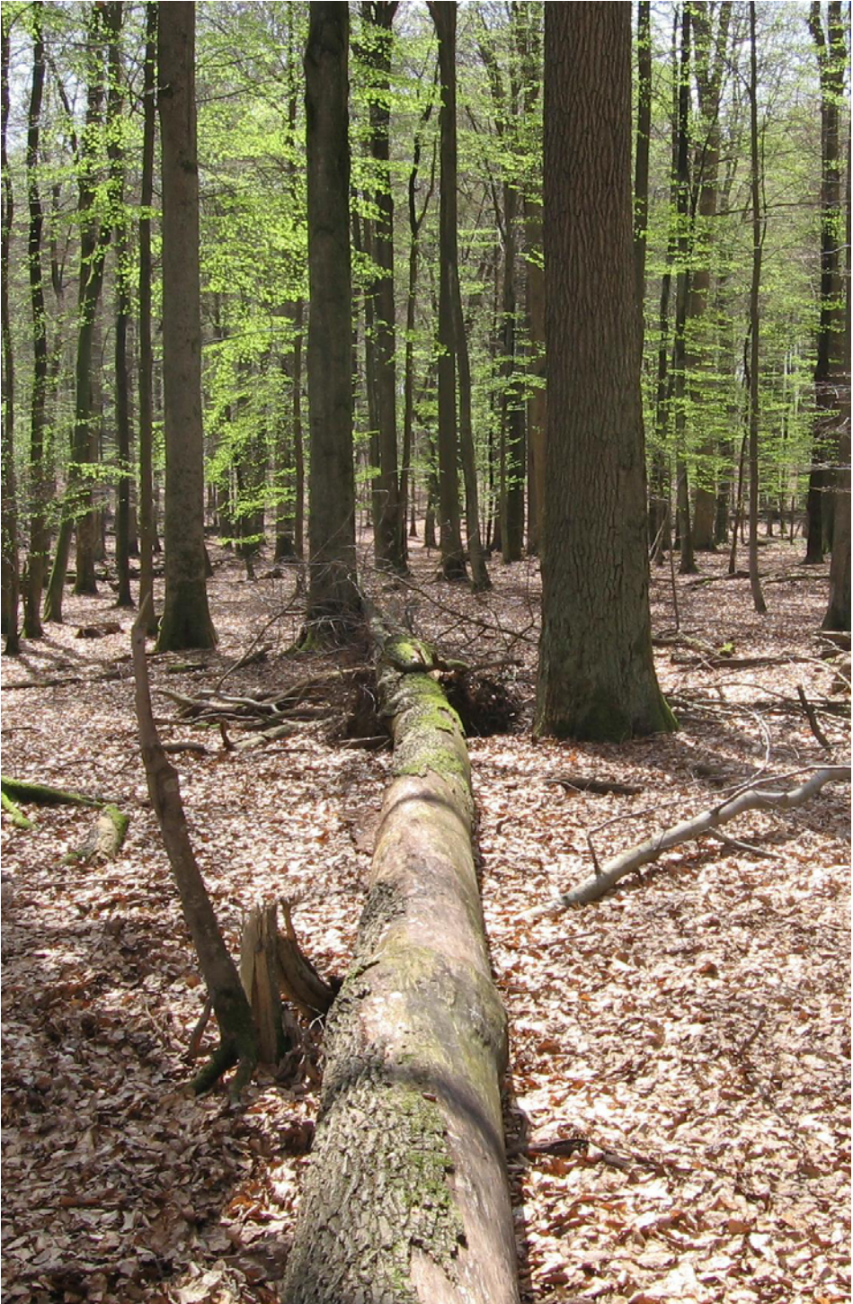
Fig. 2. The site of Xylobolus frustulatus occurrence.