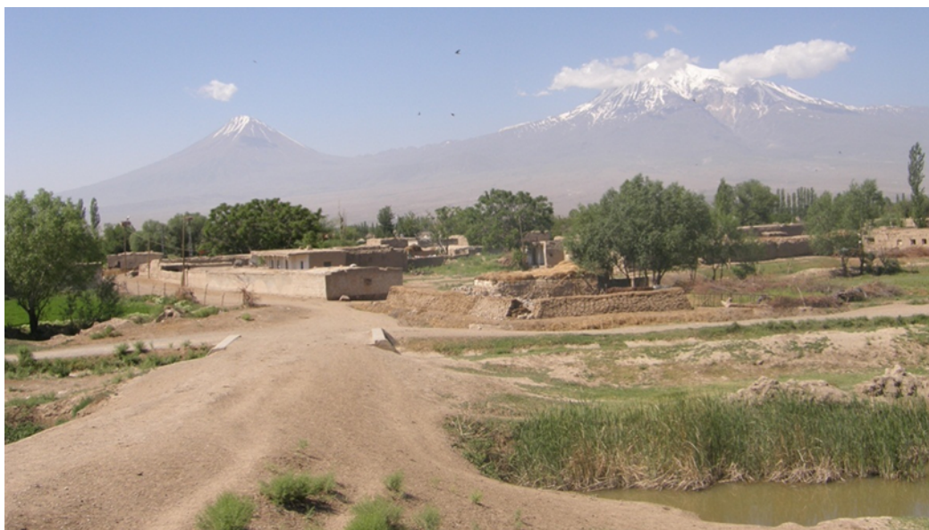
Fig. 2 General view of a village and Mount Ararat.

of the Istanbul University, Faculty of Pharmacy). These specimens were basically identified with the Flora of Turkey [1–3] and other Floras of bordering countries [72,73]. Scientific plant names were checked by using The Plant List website [74].