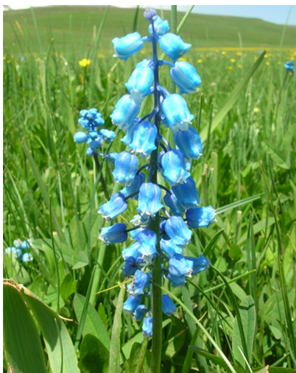
Fig. 6 Pseudomuscari forniculatum ; an endemic species.

Twenty of the wild edible plants consumed in the area are considered to be poisonous [77]. These are Diploaxis tenuifolia , Echium italicum , E. vulgare , Ferula caspica , F. rigidula , Ficaria fascicularis , Heracleum trachyloma , Ornithogalum narbonense , O. montanum , O. oligophyllum , Papaver lacerum , P. orientale , Primula auriculata , P. veris , Prunus dulcis , Ranunculus arvensis , R. sommieri , R. orephilus , Thalictrum minus , and Urtica dioica .