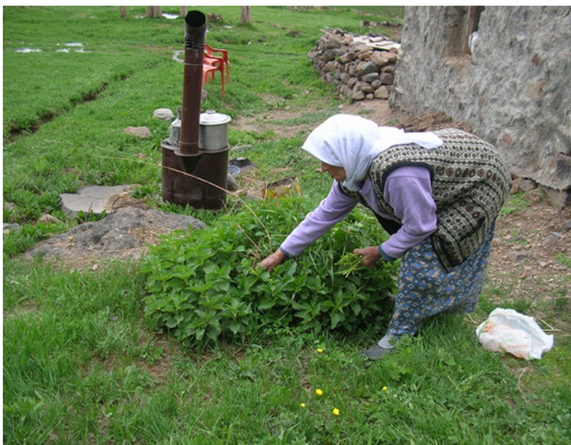
Fig. 3 A woman collecting fresh shoots of Urtica dioica .

The index was obtained by adding the UR (use report) in every use category ( i , varying from only one use to total number of uses, NU ) mentioned for a taxon divided by the number of informants in the survey ( N ). This is a quantitative method that demonstrates the prominence of species known locally. The theoretical maximum value of the index is the total number of different use categories [75].