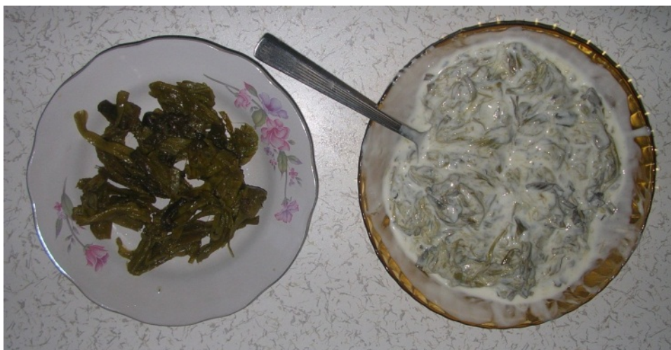
Fig. 4 Meal of Caltha palustris petioles with yoghurt.

risk of poisoning after boiling and discarding the water (Fig. 4). A practical and common method for the storage and the consumption of plants in winter is using them as pickles. Aerial parts of some Apiaceae species ( Ferula caspica , F. rigidula , Peucedanum longifolium , and Zosima absinthifolia ) are treated with salt and vinegar and prepared as a pickle. Cooking marmalade or jam with fruits is very popular among local women in the province. Fruits of Crataegus species, Rosa canina , and R. xanthina are boiled with sugar and consumed as jam or marmalade. Several aromatic wild plants are used as flavoring, Mentha longifolia and Thymus species are the most common spices which are used to flavor meat dishes and soups. Some of the taxa are used as recreational teas, to be drunk in the absence of any health problem. The aerial parts of Rheum ribes , and the fruits of Viburnum lantana and Rosaceae species are used as hot drinks (Tab. 1).