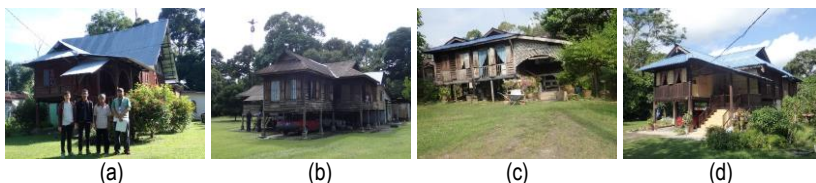
Photo 1: Among the traditional Malay house that had been sampled in this study (a) Bota (b) Ayer Tawar (c) Gopeng (d) Gerik.

the lack of exposure to them. This issue can be overcome by promoting the concept of Malay landscape and encourage them to implement this idea. The picture below will explain a bit about the exterior of the Perak Malay traditional house.