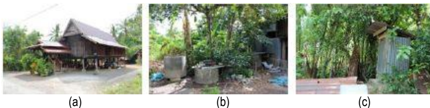
Figure 2: (a – c) showing the concept of the traditional Malay landscape design nowadays at the Northern zone; Lorong Tok Imam, Teluk Bagan Tandop, Alor Setar, Kedah.

The observation to the traditional Malay villages along Peninsular Malaysia is conducted based on the differences of geographical aspects, traditional architecture as well as the combination of uses of external and internal space of their houses. The difference regarding evidentiary geography along with topography distribution zones within Peninsular Malaysia. Four zones created which are the Northern zone (Perlis, Kedah, Penang, and Perak), Central zone (Selangor), the Southern zone (Johor, Malacca, and Negeri Sembilan) and the Eastern zone (Kelantan, Terengganu, and Pahang). It shows that the culture and the living environment of the Malay community of each zone are different and played a significant role in creating their landscape garden design. Refer Figure 2.