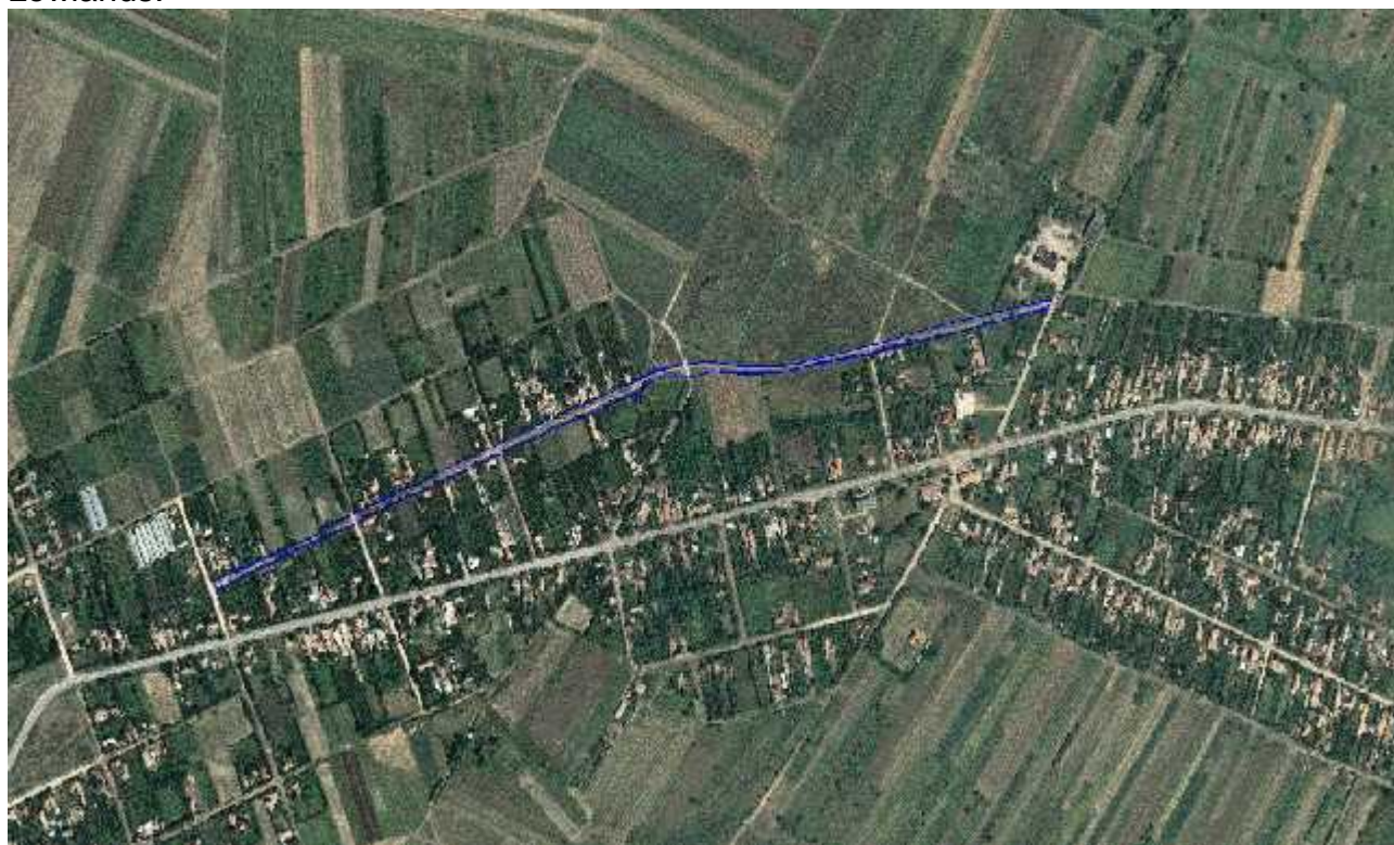
Fig. 1. Land development plan

The hereby work refers to the Perisor commune, Dolj county. Perisor is located about 40 km away from Craiova and includes 2 settlements: the Perisor village (commune capital) and Maracinele, located 4.2 km to the N-NE of Perisor. The commune is located to the South. Road connection to Craiova takes place on E79, at the exit from the Jiului Lowlands.