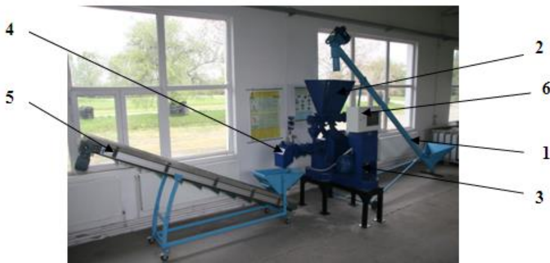
Fig. 2. Installation for soybean seeds superior capitalization – IVSS / INMA Bucharest 1-Inclined screw conveyor; 2- Supply system; 3- Extruder; 4- Cooling system; 5- Mobile belt conveyor; 6- Command and control system

The installation for soybean seeds superior capitalization – IVSS (figure 2), with a productive capacity of about 200 kg/h, was designed as a support of farmers who want to