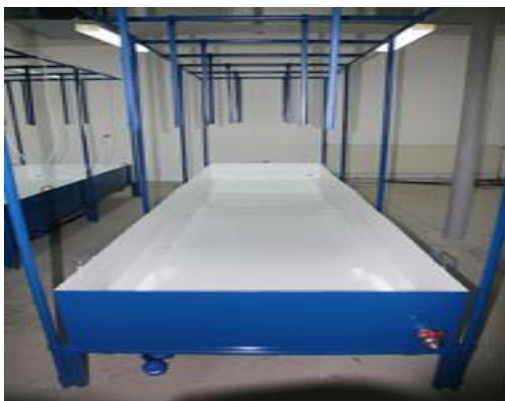
Figure.1 - Hydroponic tanks