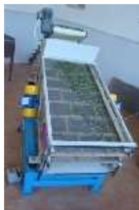
Fig. 1 - Sorter of cut plants

The experiments were performed on a sieve with squares measuring 6.3 mm, sieve having a length of 1.395 m and a width of 0.6 m. Under chosen sieve, a sheet collection box was fitted (Fig. 2) delineated into seven equal compartments, each compartment having 0,195 m.