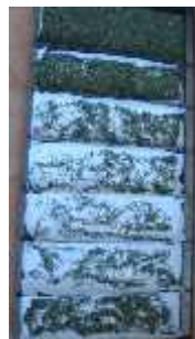
Fig. 2 - Collection box