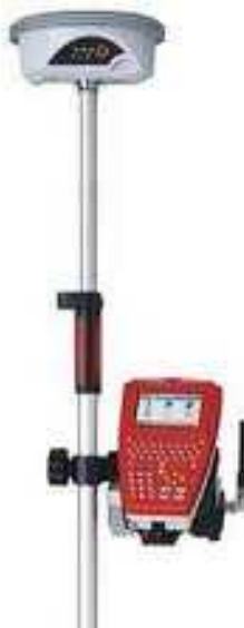
Fig. 1. GPS Leica GS 09 system

RTK Rover - low weight and no cables, is easy to use along an entire day. Built with exceptional solidity, RTK rover can stand use in hard working conditions and falls. The easy setting of an RTK reference station only needs the SmartAntenna GS09, the radio modem and a battery. Statistical measurements may be performed and raw data may be collected by adding the CS09 controller.