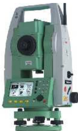
Fig. 2. Leica TS 06 total station

The used technology helps ease work in daily activities. The tool is ideal for topographic elevation and tracing works. The functions of the tool can be learned easily in very short time.