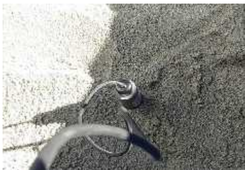
Fig. 5. Determining the moisture of the testinf medium

Wear was determined by measuring the initial masses and those resulting after a certain number of functioning hours of the active bodies (chisel), using the electronic balance (Fig. 6).