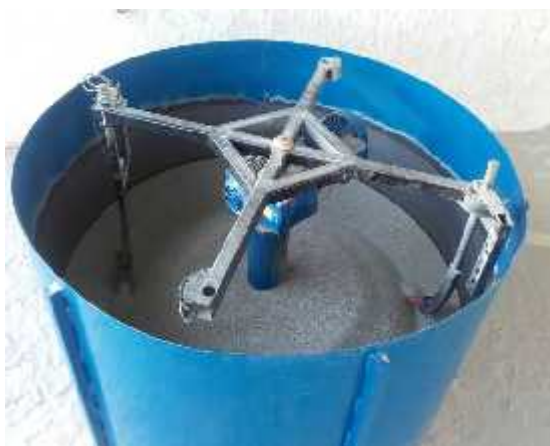
Fig. 3. Adjusting the working depth