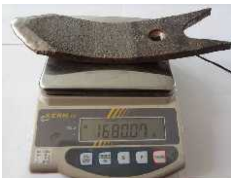
Fig. 6. Measurement of chisel knives mass with the electronic balance

Wear was determined by measuring the initial masses and those resulting after a certain number of functioning hours of the active bodies (chisel), using the electronic balance (Fig. 6).