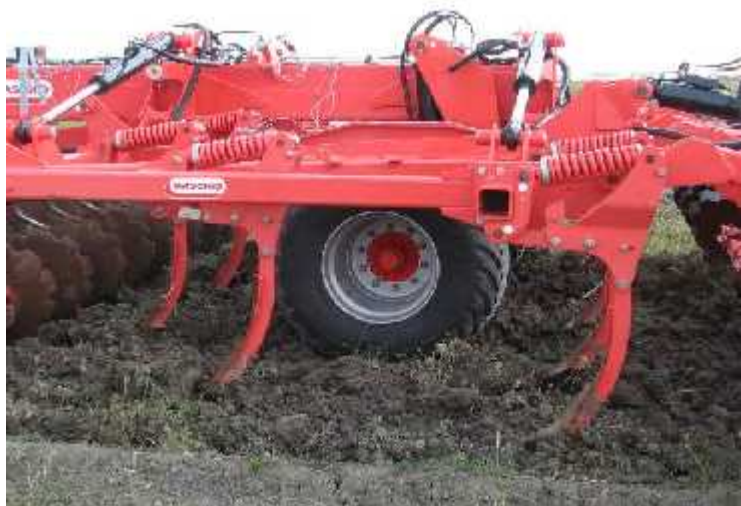
Fig. 1 – Chisel type active bodies [7]

By breaking soil structure, chisel type active bodies (Fig. 1) achieve its deep processing.