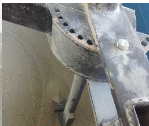
Fig. 4. Adjusting the angle

With set overall and functional dimensions, the stand allows the testing of chisel knives on a circular path with a diameter of 1600 mm at a maximum depth of 300 mm.