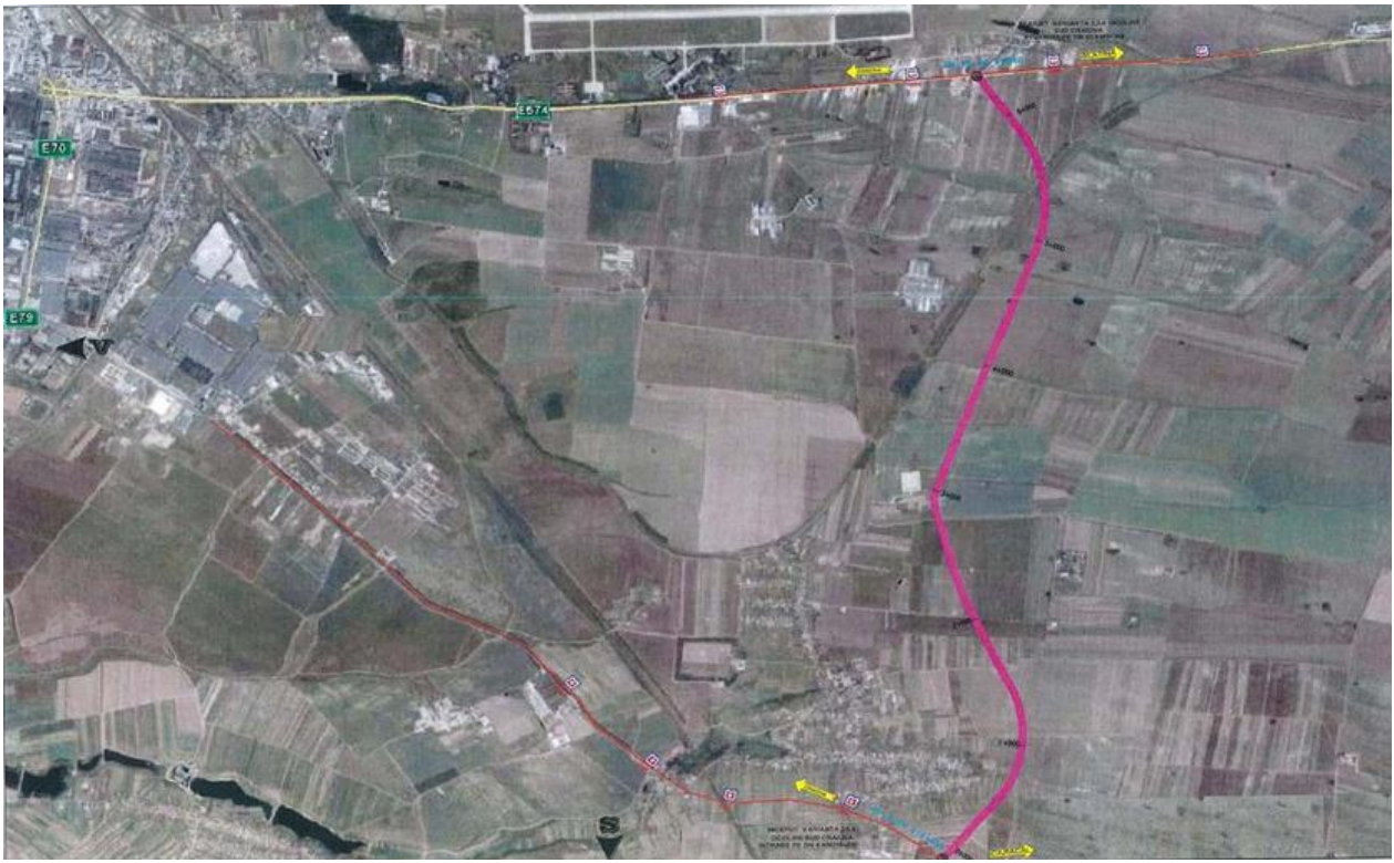
Figure 1. Work framing in the area