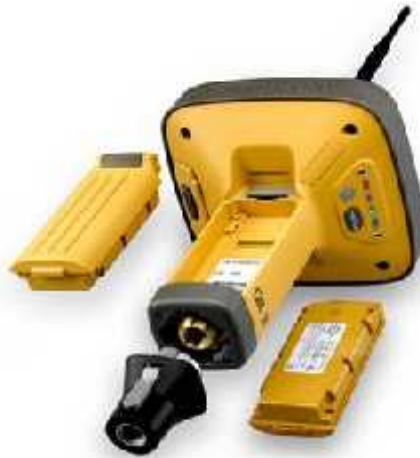
Fig. 1. Receiver GPS Topcon GR-3

The GR-3 Topcon receiver is now available with the new UHF digital radio system, using DSP technology. This technological progress ensures higher reliability and performance compared to the former UHF analog technology and establishes new standards for performance, accuracy and innovative design (fig. 1).