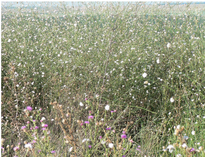
Fig. 1. Physiognomy of the phytocoenoses of the association Dauco-Cephalarietumtransylvanicae at the periphery of Craiova (orig.)

In many research stations, we found a good representation of nitrophilous phytocoenoses made up of biennial or perennial species belonging to the alliance Arctionlappae R. Tx. 1937.