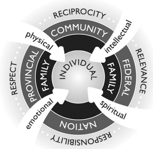
Figure 1. Indigenous Wholistic Framework.

Building on Figure 1, Figure 2 provides a visual representation of the interconnections in an institution between senior administration, faculty/departments, and faculty/staff/student with policies, programs, and practices. It shows the inter-relationships of the global-national-local to higher education, particularly evident in Canada’s structure of provincial jurisdiction of education but federal responsibility of First Nations, Métis, and Inuit education. Indigenization as a form of social inclusion requires recognizing the work and dedication that has happened from the grass roots of an institution to the senior executive leadership to create systemic and broader societal change.