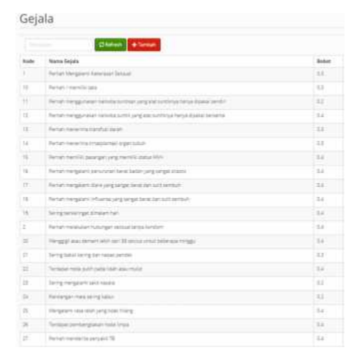
Figure 5. Risk factor HIV/AIDS

Symptoms page was a page that could only be accessed by experts and admin. On this page, the expert and admin could process the data density in the form of add, change, and delete data in the form of symptoms, risks, and density values. The management of density data as a basis for Dempster-Shafer calculations was done on this page.