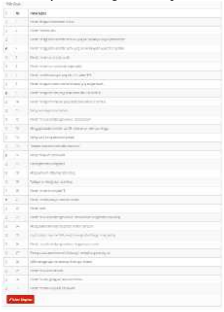
Figure 2. The display of the symptom selection page

An example of HIV/AIDS case control system using the Dempster-Shafer method