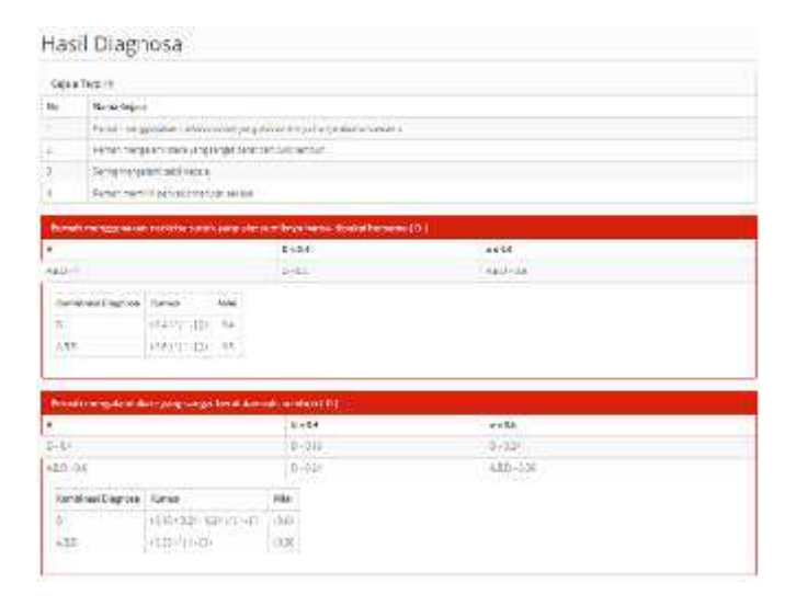
Figure 3. Inputting the symptoms

On this page, users did HIV risk detection by selecting the symptom data according to the factors that had been experienced.