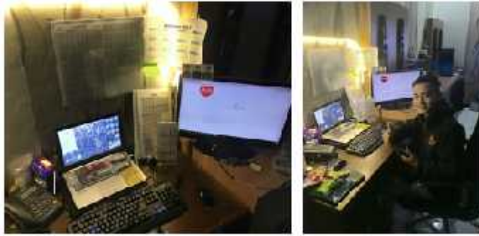
Figure 4. Entrepreneurship Program Implementation