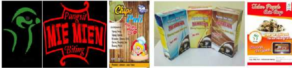
Figure 7. Design Product