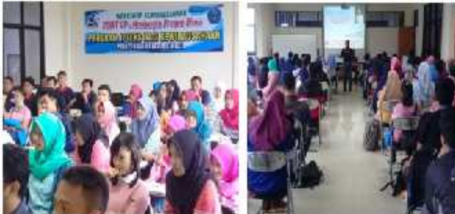
Figure 6. Entrepreneurship Workshop