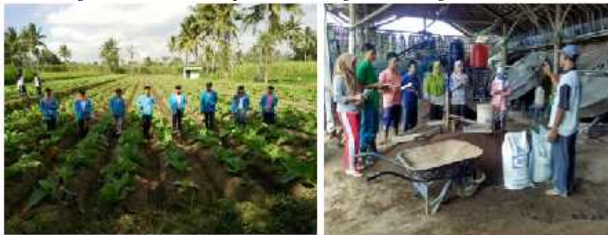
Figure 2. Entrepreneurship Program Implementation