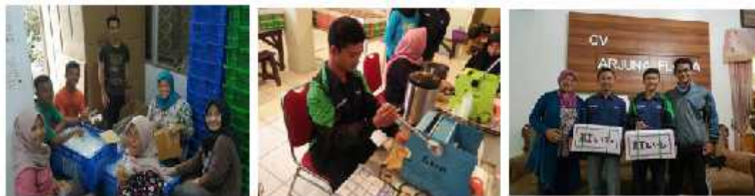
Figure 3. Entrepreneurship Program Implementation