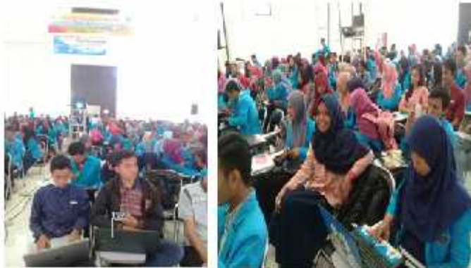
Figure 5. Entrepreneurship Workshop