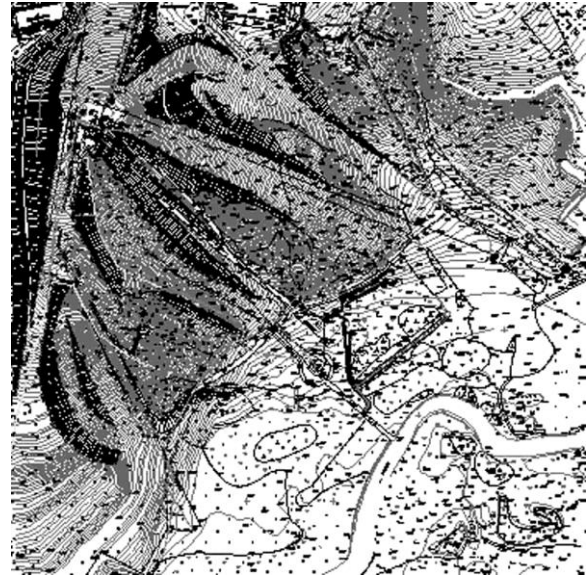
Fig. 2. Area topographic map.

Natural terrain marks of the territory of the health resort «Sorochany» vary over the range of 145-205 m. The territory located at the top of earth fill 229.3 m has the maximum mark. Angle of the hill slopes average out: about 90% of the slope surface has the slope angle 250-450. Gradient grade of the other territory varies from 450 up to 600.