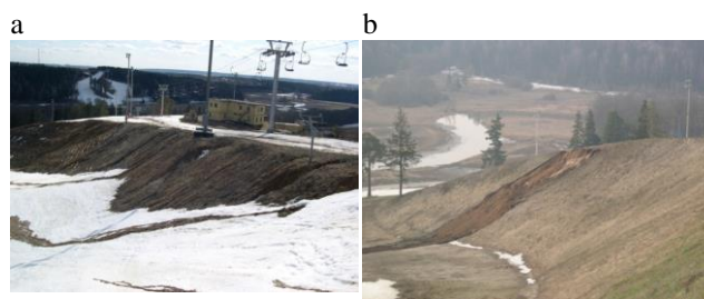
Fig. 1. Monitoring data of RSC «Sorochany»: a – one of the hills before woodland conservancy work (03.2006), b – unexpected landslide (04.2008).

The research [8] shows that 58% of hills are fixed by grass sowing, 27% demand topsoil salvage and grass sowing, 15% - repair of the stabilized constructions.