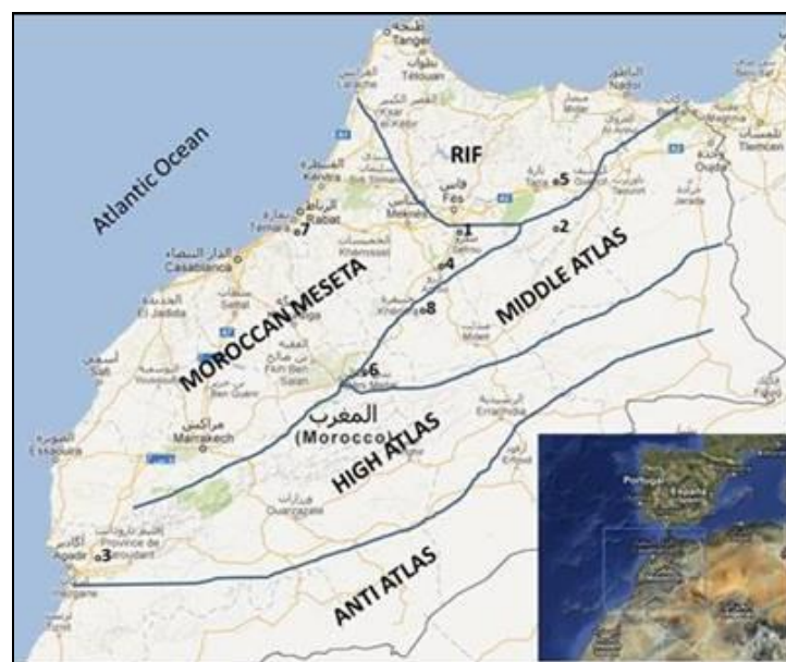
Figure 1. Main tectonic units of Morocco (Modified from Crevello, 1991 and Ledo et al., 2011).

The quantification of salt weathering of the samples was measured by assessing the dry weight loss (DWL) of the rocks. There have been many laboratory test proposed for DWL determinations. The most used tests are the American standard test ASTM (C-88, C-128), the Germany standard test DIN (52111) and the Spanish standard test UNE-EN (12370). All these test have three stages: immersion (total), drying and cooling. We followed the Spanish standard test for DWL assessments (except the dimension of the samples since we had some difficulty to provide thick samples, nevertheless the test allow us to compare the rocks against salt effect). In this test 14% Na 2 SO 4 solution was used. In the immersion stage, clean and dry rock samples were introduced into a container and covered with the solution at 20 °C for 4 h. In the drying stage, the samples were taken out of the container and settled into the heating cabinet at 60 °C for 16 h. The duration of this cycle is 24 h and the similar procedure was repeated for 15 days (total 15 cycles). The solution was changed every five cycles as the samples lose weight. After 15 days, the tested samples were cleaned with pure water to eliminate salt. The samples were then dried until a constant weight realized. The dry weight loss (DWL %) was calculated at the end of this stage.