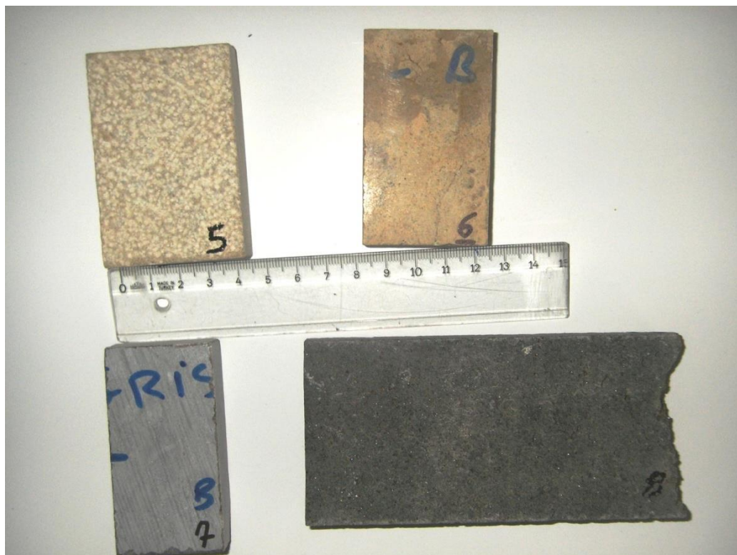
Figure 3. The studied samples of dolomitic limestones of Taza (5), Bejaad (6), and Gris (7), and Khenifra basalt (8).