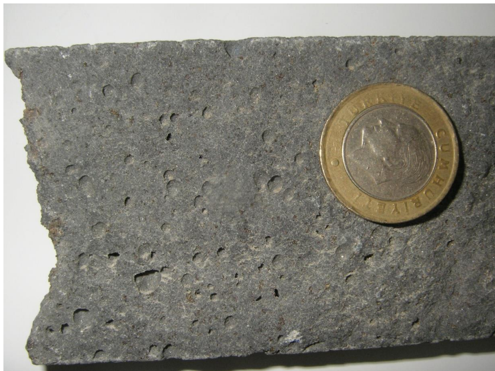
Figure 5. The studied sample of Khenifra basalt. The pores relatively more connected than all other samples (except Bir Jdid limestone).

It is clear from the Table 2 that there has been no positive or negative correlation between the bulk-dry densities and powder densities. When excluding sample 8, a slight positive correlation can be seen