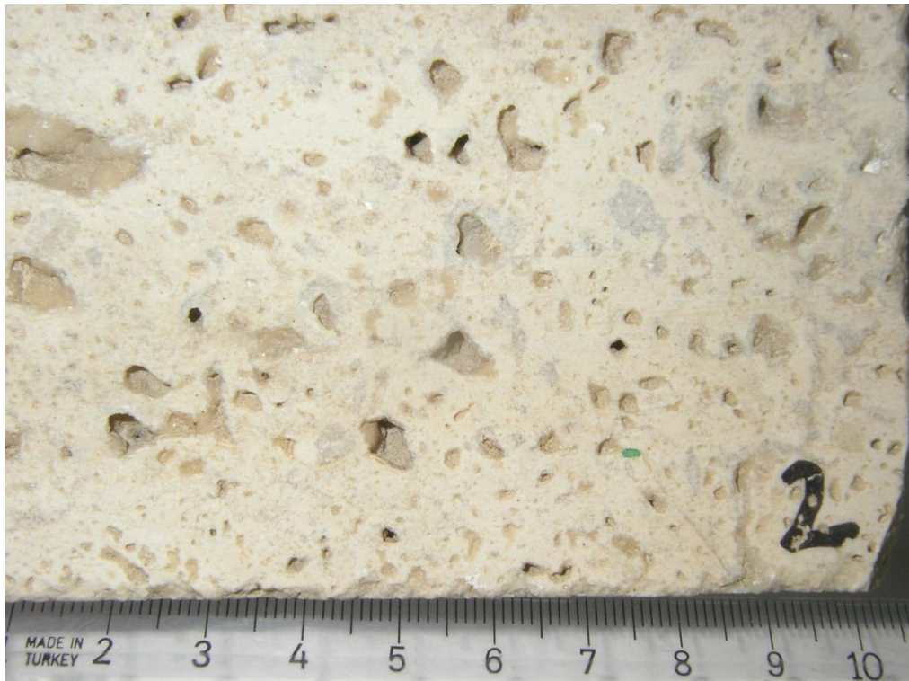
Figure 4. The studied sample of the Volubilis dolomitic limestone. Note that quiet large (up to 5 mm) pores.