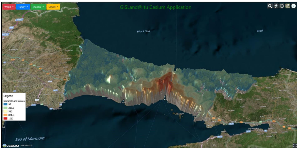
Figure 4. 3D Nominal Land Values of Istanbul province