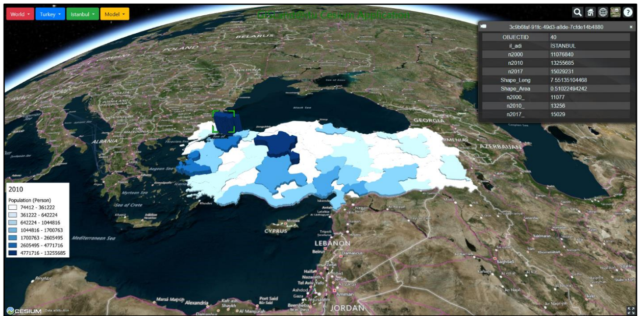
Figure 2. The population of Turkey provinces in 2010