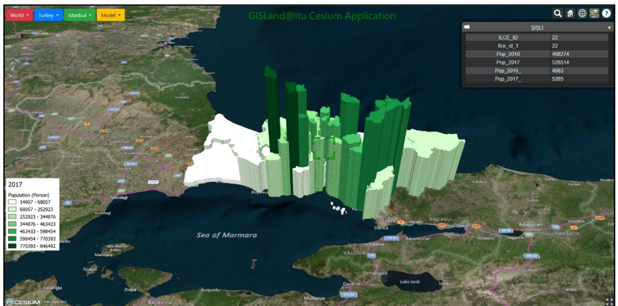
Figure 3. The population of Istanbul province in 2017

Since Cesium provides data interoperability, the projects which are created with using other platforms can be integrated easily. 3D Nominal Land Values of Istanbul City Project is visualized with Cesium JS. The model is created as pixel-based raster data. In order to visualize it on 3D Cesium globe, raster data converted to glTF format using a three.js library, Qgis2Threejs. glTF data format provides visualization of raster data but users cannot query on the data.