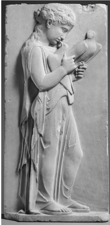
Figure 1. Grave stele of a little girl, ca. 450–440 B.C. Greek, Parian marble. Metropolitan Museum of Art, http://www.met-museum.org/toah/hd/dbag/hod_27.45.htm

desolation, because there is one, and perhaps more, who desires to be with the beloved even if that means the living must embrace death. 25