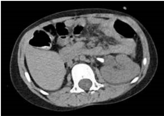
Fig. 1. Axial CT scan showing proximal obstructing left ureteral stone measuring 1.0 cm.

wheezing. His medical history was notable for congenital solitary kidney, translocation between chromosomes 11 and 14, and developmental delays. He had no history of nephrolithiasis. He had normal vital signs with a benign abdomen and no costovertebral angle tenderness. Laboratory evaluation revealed a leukocytosis of 17.2 \times 10^9/L and a rise in serum creatinine from 0.7 to 2.2 mg/dL. Urinalysis and microscopy revealed a pH of 5.0 with 4 RBCs/hpf and 31 WBCs/hpf. A contrast enhanced abdominal and pelvic computed tomography (CT) scan demonstrated a proximal obstructing left ureteral stone measuring 1.0 cm with HU of 487 (Fig. 1) along with multiple large non-obstructing nephrolithiasis (Fig. 2).