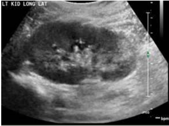
Fig. 3. Ultrasound performed post-operative day 2.