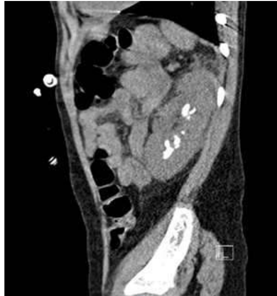
Fig. 2. Sagittal CT scan showing multiple large non-obstructing nephrolithiasis.

gram-negative growth, no speciation. He was discharged home on POD#5 with a course of trimethoprim/sulfamethoxazole and plans for definitive stone treatment by ureteroscopy two weeks later.