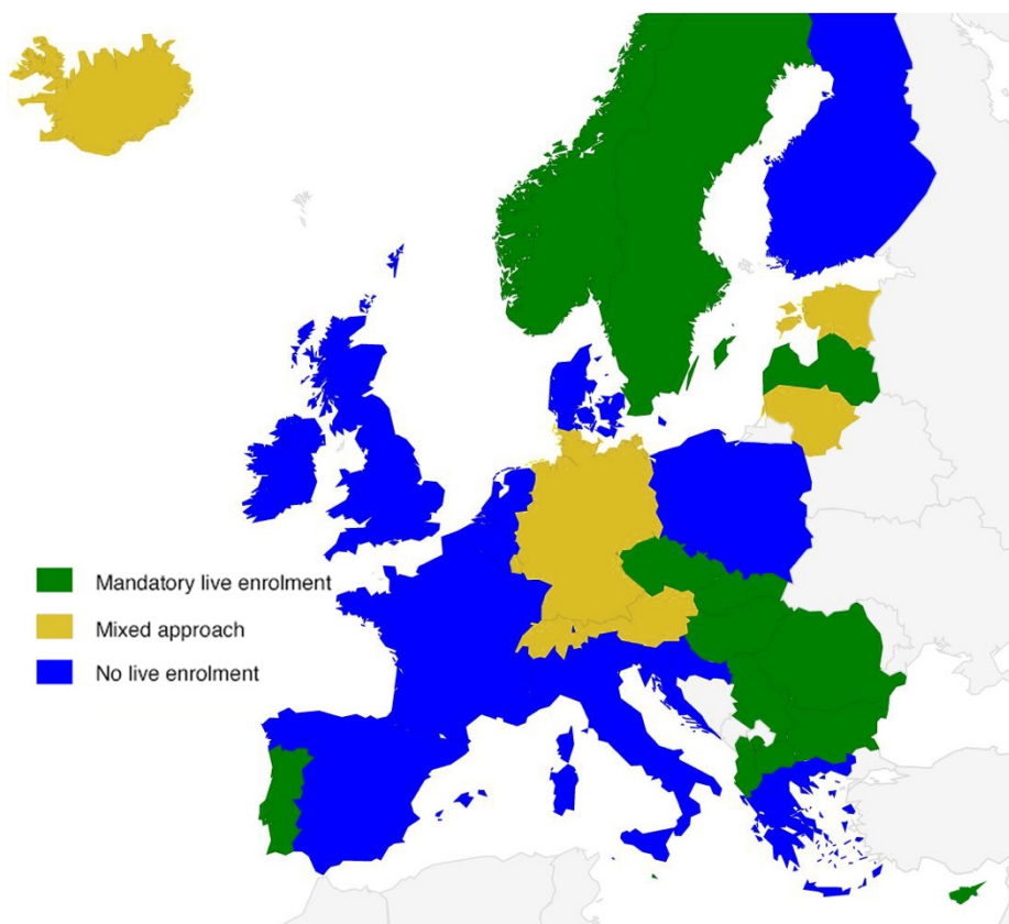
Figure 1: State of the live photo enrollment in the Europe