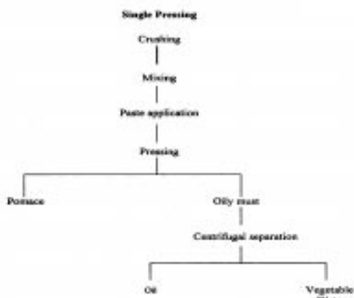
Figure 1 Diagram of olive oil extraction by pressure.

found in the literature. Small diversities in the machinery of olive crushing, the temperatures applied, the duration of contact with the water and the total volume of water used may cause significant changes in the total polyphenol content (Solinas, 1975, Boskou, 1996 / Vekiari, 2001).