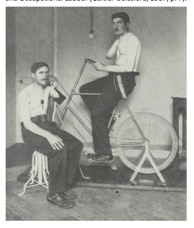
Figure 4 Two maimed soldiers training on an ergometric bicycle in Amar's Laboratory for Military Prosthesis and Occupational Labour (Galtier-Boissière, 1917, p. 7).

In this phase, special emphasis was put on training the mutilated limb, more specifically on the "sensitive training of the stump", as the reduced power and sensitivity, trophic disorders and/or sensory disturbances of the stump threatened to undermine the benefits of the prosthesis (Galtier-Boissière, 1917, pp. 4-6, p. 36). Performing progressive movement exercises (ascending and variable pressure) with the help of training and measuring devices —such as the ergometric cycle (see fig. 4)— could correct these deficiencies. The use of the appropriate effort could be learned as the device registered the smallest nuances in pressure. In this phase, mental, sensory, and behavioral 're-programming' were key. As a result, it was no longer the damaged nerves that controlled the missing limb, but the training device and the future prosthesis.