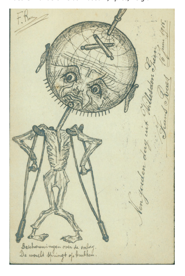
Figure 1: "The world is hobbling on crutches," Franz Raes © Flanders Fields Museum, Ypres, Belgium

of the war on August 4, 1914, only 65,000 soldiers were left in November 1914. As a result of the overwhelming onslaught of the German forces, many soldiers were wounded or fled to the Netherlands where they would be interned for the remainder of the war in refugee camps. Of those wounded during the early battles, some were evacuated to England, hospitalized in an occupied country or transported to the north of France. After these tumultuous first months, Belgian disabled soldiers could be found in the Netherlands, occupied Belgium, France, and England.<sup>6</sup> Eventually initiatives would be taken in all of these countries to alleviate the suffering of these soldiers, but the first region to make a concerted effort to improve their lot was the north of France where the Belgian government itself had retreated.