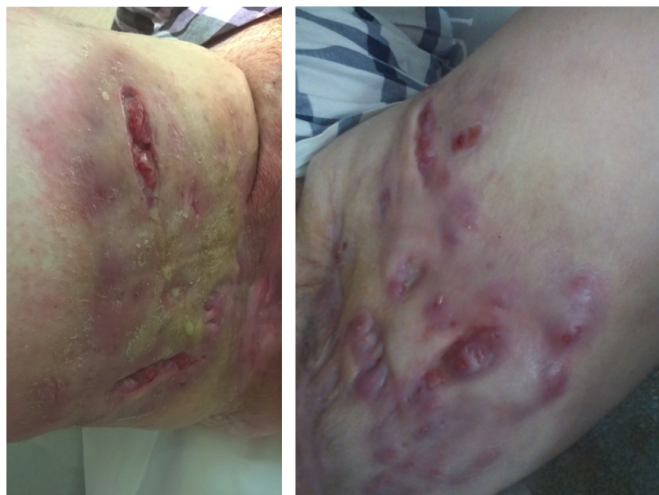
Figure 1. Both treated inguinal areas on the day of the hospital discharge.

by the patient whenever leakage necessary. We continued the NPWT for two weeks after the surgery, with the dressing change every two days in the beginning and every three days later (5 changes in total) and the concomitant intravenous antibiotic therapy. Perioperative antibiotic therapy corresponded to bacteriological tests, performed from lesional skin swabs, taking the potential risk for embryotoxicity in concern (erythromycin 600 mg i.v. three times a day and cefotaxime 2 g i.v. twice daily for ten days).