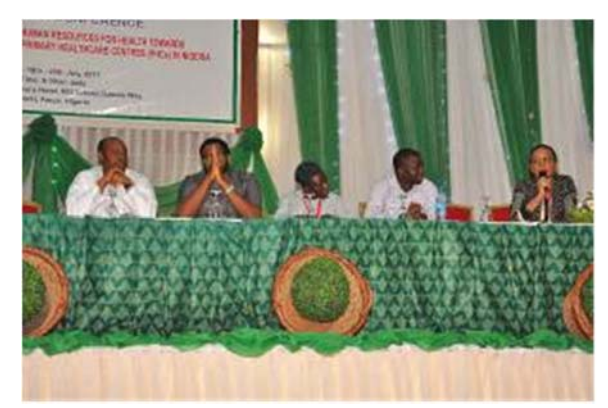
Plenary session with National HRH Forum members

National HRH conferences facilitate better long term HRH planning and management, and can ultimately contribute to improved health outcomes in states throughout Nigeria.