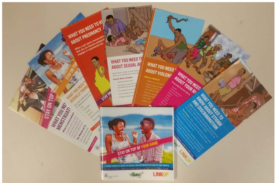
A peer outreach campaign under the Link Up project in Uganda, “Stay on Top of Your Game,” addressed SRHR issues such as menstruation, sexually transmitted diseases, pregnancy, violence, rights, and stigma and discrimination.

Under the Link Up project in Uganda, the Community Health Alliance Uganda (CHAU) and Marie Stopes Uganda (MSU) will lead the implementation of peer-outreach activities designed to increase access to HIV and SRHR services among young people living with HIV in Luwero and Nakasongola districts in Uganda. Link Up HIV-positive peer educators will counsel young people living with HIV in community-based support groups, providing referrals to facilities that offer HIV and reproductive health services.