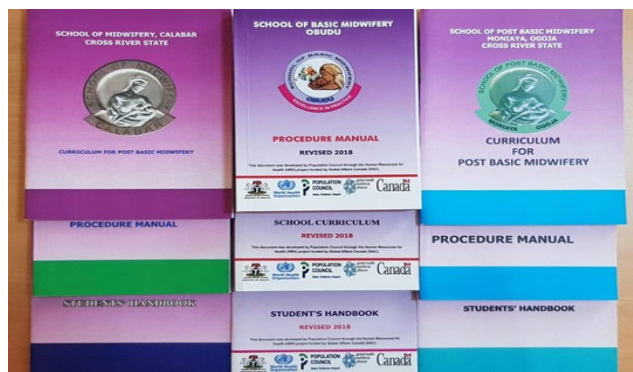
Curricula, manuals, and handbooks for Cross River Midwifery schools

Draft documents from the committee meetings were sent to NMCN for its recommendations. Validation meetings with curriculum review committee members, Ministry and NMCN officials, curriculum experts, and Council staff finalized the documents for printing and distribution to each school for NMCN accreditation.