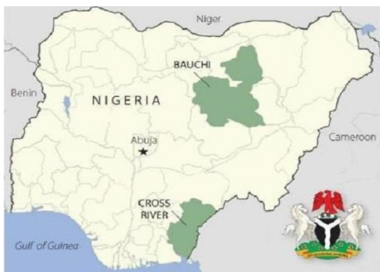
Figure 1: Study Location (Bauchi and Cross River States)

The study was conducted in both Bauchi (North-East) and Cross River states (South-South) (Figure 1) of Nigeria. Both states were selected for the study because they are focal states for the HRH Enhancing the Ability of FLHWs to Improve Health in Nigeria project and offer the possibility of contrasting data from the two states, which are geographically and culturally varied, although both states' MNCH indices and HRH situations are poor.