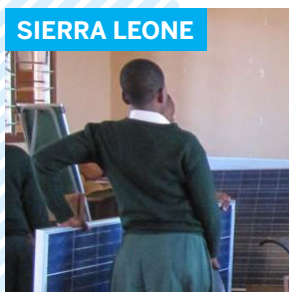
Exploring solar technology and its applications to improve livelihoods and resilience among adolescent girls