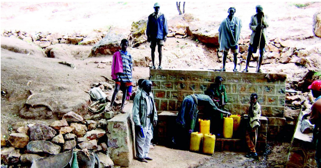
Residents in a drought-ridden region in northern Ethiopia use a pump to collect water.

To fully understand and address the needs of vulnerable communities, the Council is building on its existing research, deep global research expertise, and proven approaches in reaching and working with vulnerable populations to examine how humans interact with their environments and explore how to test and develop successful strategies for building resilience.