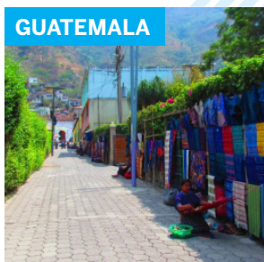
Working in Santa Catarina Palopo to describe the watershed risks and shifts in fertility and mobility