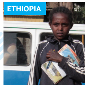
Applying DHS data to understand how drought affects migration, education, child marriage, and health