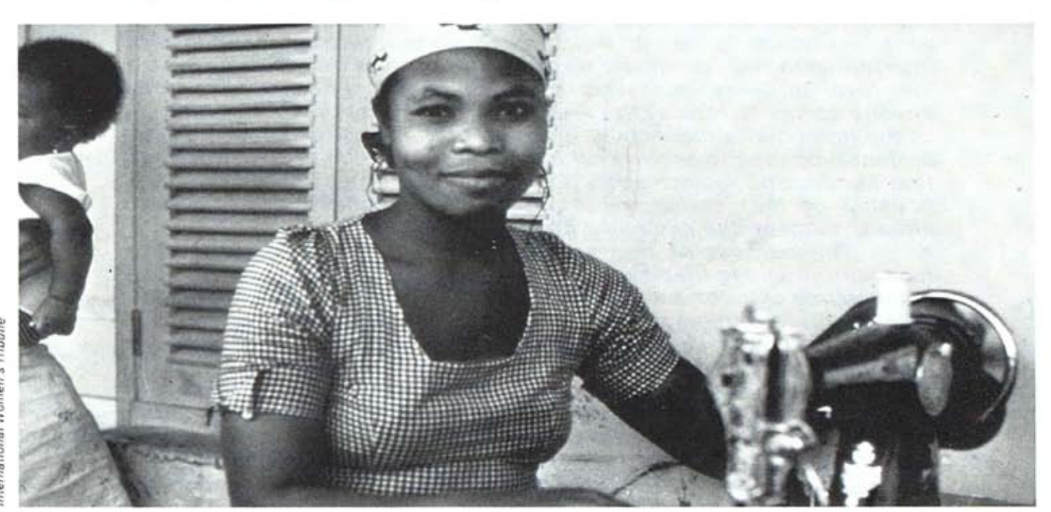
international Women's Tribune

The situation when "feminine" crafts are commercialized can be even worse. In India one of the big commercial operations in handicrafts is white embroidery done on fine cotton material called "chikanwork." The women who do this work are from the Muslim community and because of social customs are confined to their homes. They receive the work from traders (middlemen); for the handstitching of a shirt and its embroidering they earn a pittance equal to about U.S. 25 cents for eight to ten hours of work. Such wages are exploitative.