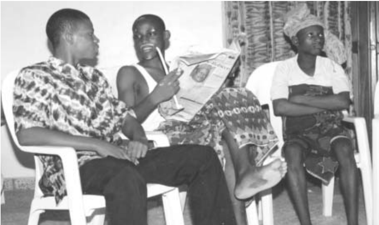
In a skit on marriage customs, the boys critiqued certain aspects of traditional Nigerian culture, such as brideprice, while also showing great fondness for many other aspects of their culture, such as its trove of proverbs.