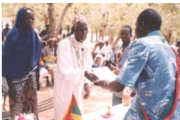
Public marriage ceremony in Bere; A female member of the audience and her husband receive their family record book after formalization of their marriage

Sixty-nine people participated in a workshop on gender-based violence. A case of discrimination related to children's education was noted.