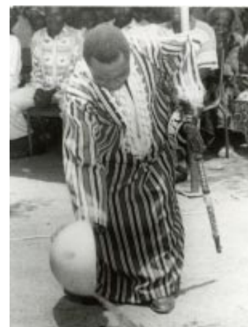
Through this ritual action, this man was given a mandate to support, in the name of their ancestors, the action taken by the women of Béré to abandon Female Genital Cutting