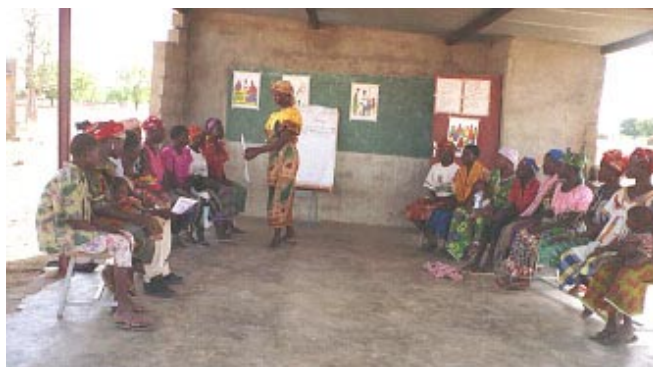
Educative sessions on human rights with the audience both (male and female) in Noghin village (Binde district)

The community facilitator followed the schedule determined by the participants and began Module 1 in February, 2001. The sessions on human rights and the problem-solving process were held every other day to allow time in between classes for assimilation of themes and sharing of new information with other members of the community. The participants implemented session activities both in the class and in the village. Participatory techniques such as dance, song, role-play, poetry and small discussion groups were