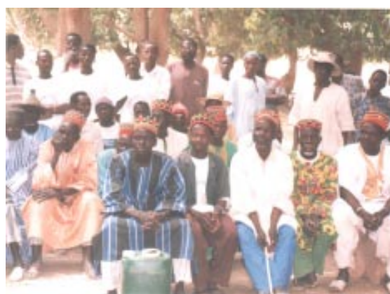
Participants who attended the inter village meeting in Sondré possible