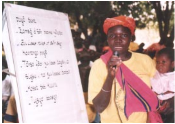
At the Sondré inter-village meeting; a female member of the Signoghin village class presents the problems that her village wants to solve

Villages sharing the same health centre (about eight villages per centre) met at the end of both cycles. During these day-long meetings, representatives from each village exchanged ideas about new information learned and activities implemented as well as pointing out strengths and weaknesses of the programme with the community leaders, development and administrative partners who attended. The participants also discussed and proposed solutions to problems that were common in all the villages. Six inter-village meetings were held. The first three were held at the end of the first two modules and the last three, at the end of Modules 3 and 4.