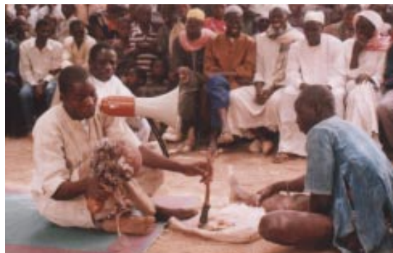
A scene from a skit during an inter-village meeting

This is related to the first step in the strategy: to identify community decision makers for the programme. A date was fixed with each village delegation to hold a general assembly for orientation and discussion with the entire village.