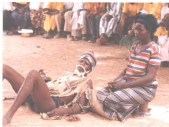
Male and female participants in Bindé present a play on the negative consequences of female genital cutting

“There is more involvement of traditional leaders in the fight against Female Genital Cutting and birth spacing.” (Female participant, Kondrin village, Béré)