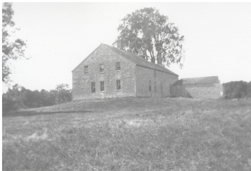
Dalton Farm Cumberland Foreside, circa 1915. After the sale of the Town Farm on the Foreside, the Dalton sisters rented the farm to the Cram family from 1904 to 1919.

On February 26, 1866, Cumberland voters approved a measure to "sell the Town Farm and all the appurtenances thereof..." The 1865 Overseers report gives one reason for the sale, stating that in "regard to the Paupers now in the almshouse, from the large number that have been supported there for years past, death has swept them away & but one remains as a living mon-