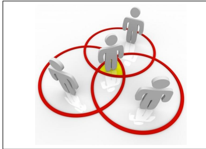
Fig.1. Silo Effect [5]

and at the same time can create a bad silo. It keeps people away from each other where they do not meet face to face to discuss the organization progress or success or even future challenges or constraints. Silo effect “refers to a lack of information flowing between groups or parts of an organization [5].” The following figure shows how people work in the same organization, but do not see each other or even communicate with one another about their projects and goals which at the end create silos between them.