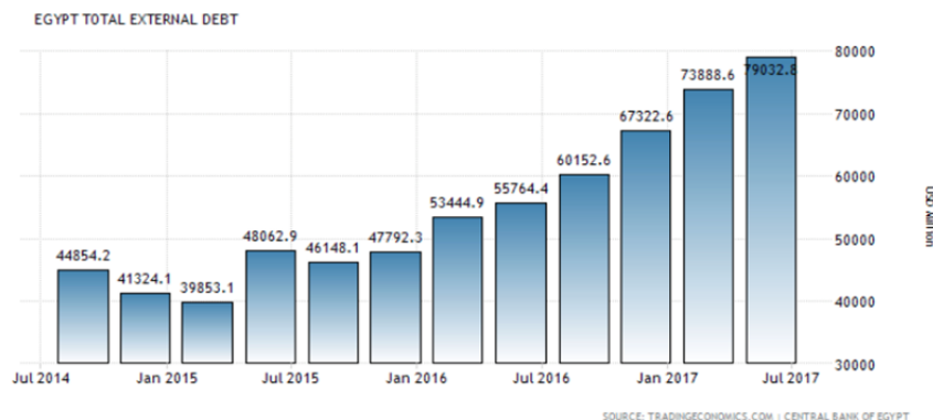
Graph (3) Egypt Total External Debt: 188

The second aim of the loans is to initiate high-labor infrastructure projects. The loans should be invested in building airports, railroads, solar energy projects, schools, universities, and hospitals. This type of investment will not only raise the level of infrastructure in Egypt to accommodate an extra couple of million of Syrians, but will also provide many direct and indirect job opportunities for newcomers. In 2016, the solar energy industry in the US successfully employed more than 250,000 workers. 189 Investing in the solar energy sector in Egypt could accommodate similar numbers. 190 There is high potential in Egypt to invest in this sector, as solar power in Egypt is available all year round. 191 Emulating Frankfurt airport in Egypt as a transit station to connect Europe to Africa will provide at least 20,000 direct jobs. 192 This number could lead to 80,000 indirect jobs. 193