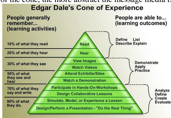
Figure 2: Krucut Dale

Dale in Davis & Summers (2015) said: "one's learning outcomes are obtained through direct experience (concrete), the reality that exists in one's living environment than through artificial objects, to verbal symbols (abstract). Increasingly to the top of the cone, the more abstract the message media is.