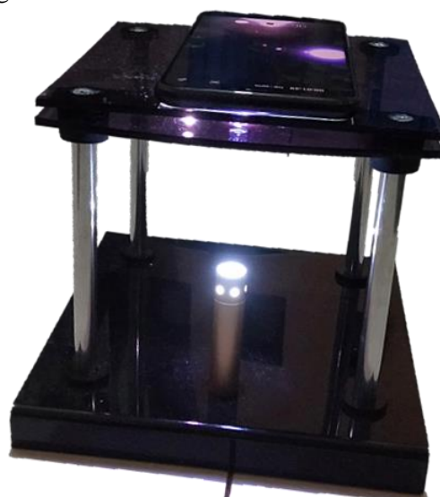
Figure 3: Microscope digital portable auto design

After conducting instructional analysis, characteristics of students, and mandated in the 2013 curriculum, the researchers developed of learning media of a microscope digital portable auto design. This media will take advantage of technological developments in the form of smartphones that are like the various features in the playstore. This microscope digital portable auto design uses a laser lens that will be combined with a smartphone that is then used to observe objects or insects that are micro-sized, such as the eyes of people's motion flies in the body to fleas and worms, organs in ants and insects such with that. The digital microscope design in question is shown in figure 3 below.