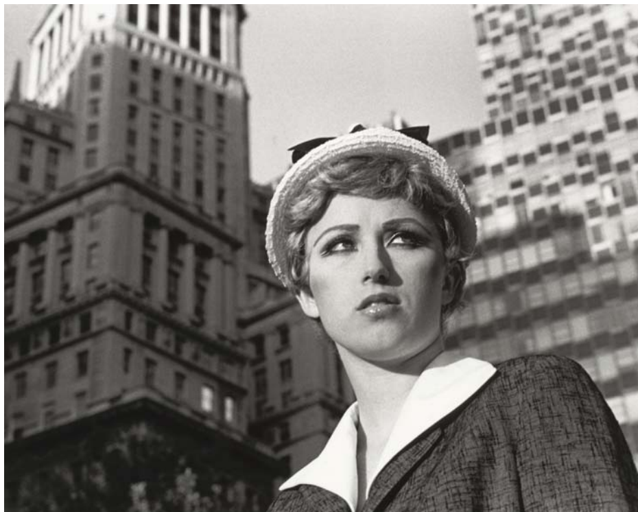
Cindy Sherman Untitled Film Still #21 1978

Arguably Sherman's most iconic film still is Untitled Film Still #21 (1978). It has become so famous that many artists across different mediums have recreated the image. It is a close up of a young woman in a hat with a bow. She is shot from a low angle, which typically makes a person seem powerful but the skyscrapers behind her seem to cancel out that effect. Her eyes, at a sharp angle, and facial expression show hints of a perplexed and worried mood as if she is feeling remorse. Many have claimed that the image represents a "country girl" coming to the city for the first time. The look on the woman's face is the look of someone who was not expecting what the city would be like. This reactive face helps to sell the image as a film still and as part of a larger narrative. It looks like it could be a still of a female character in an Alfred Hitchcock film.