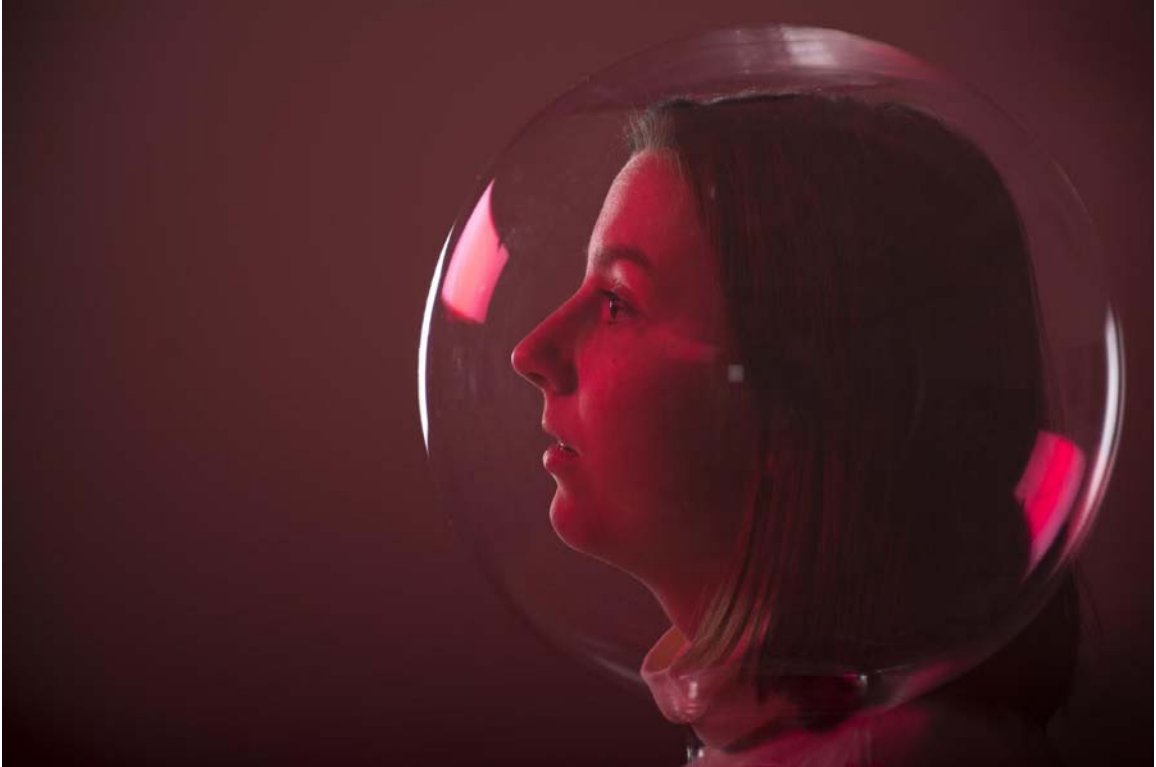
Untitled Film Still #8

This Image was created using the Nikon D7100s double exposure mode. I realized I could make someone look like an astronaut with this feature while experimenting with a water bottle and forced perspective. The “helmet” is actually a 4” christmas ball. After taking the image of the subject and then the ball, the camera combines the images like a double exposure. I wanted to have the subject look in awe as if she’d seen the most beautiful thing in her life. I really like this picture next to Film Still #25 aligned so that the astronaut is looking at the alien.