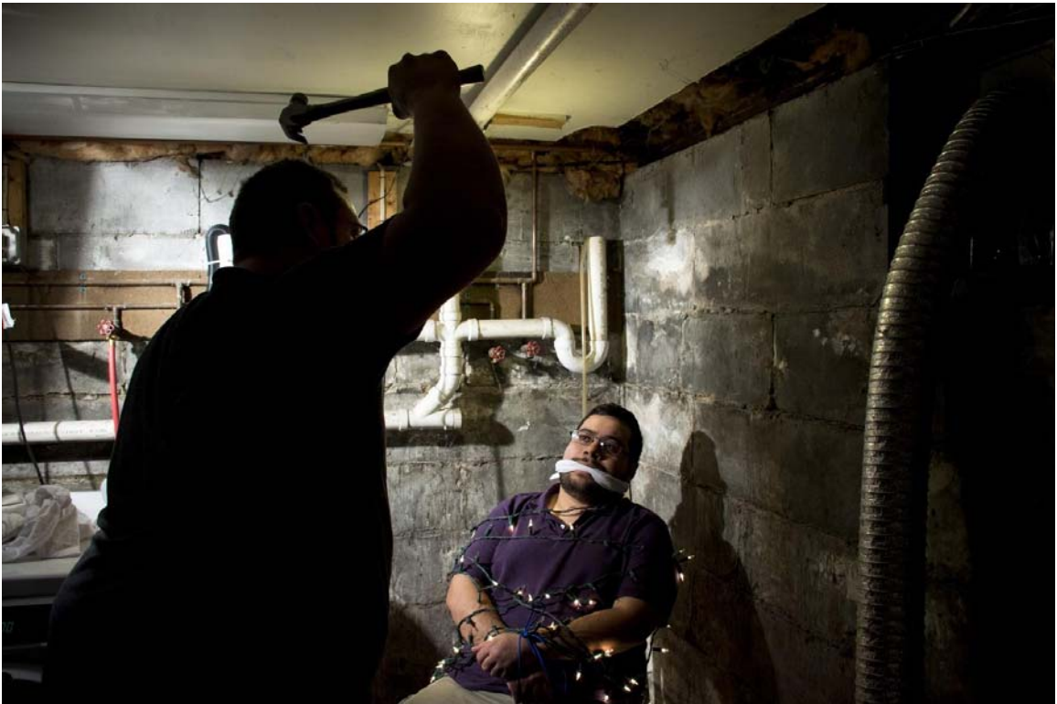
Untitled Film Still #3

experimented with lights on the sides of my subject which you can see on the left shoulder of the subject. I decided to pull one light in front of the subject so that the light highlighted the black eye and just kissed the the opposite eye, like an extreme version of Rembrandt lighting. I had the subject look down so that he would appear to be furious and about to attack. To make him look more like a boxer in a fight I used a trick I learned online to make fake swear. A mixture of water and vegetable glycerin was sprayed onto the subject to simulate beads of sweat on his head and body.