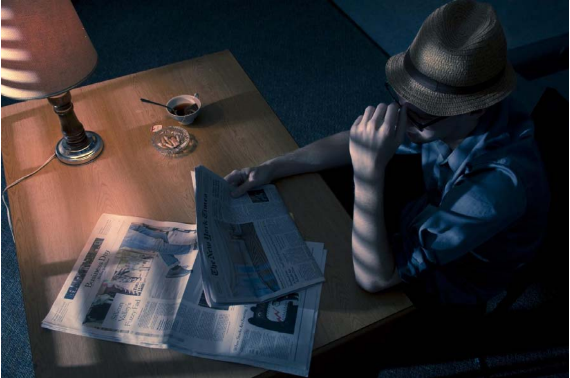
Untitled Film Still #2

Untitled Film Stills #1 and 2 are inspired by film noir films. My initial idea was to create a scene of a detective but, others have mentioned to me it looks like someone devastated by something in the news. To add visual interest I made a cardboard cutout with slits in it and put it in front of my light source to mimic the look of blinds. I especially like the way this looks on the lampshade. The lamp, teacup, ashtray, and hat were all purchased at a thrift store to give the image a more vintage feel. The color scheme was created to look like the classic Hollywood gold and teal look. I accentuated this color scheme in post by pulling the shadows blue and the highlights a little orange. I especially like how the shirt of the subject looks. Its blue color and the variations in lighting reminds me of Crewdson's work. Compositionally, I shot the subject from a high angle to underscore their feeling of being overwhelmed. In #2 the lines on the floor are parallel to the desk