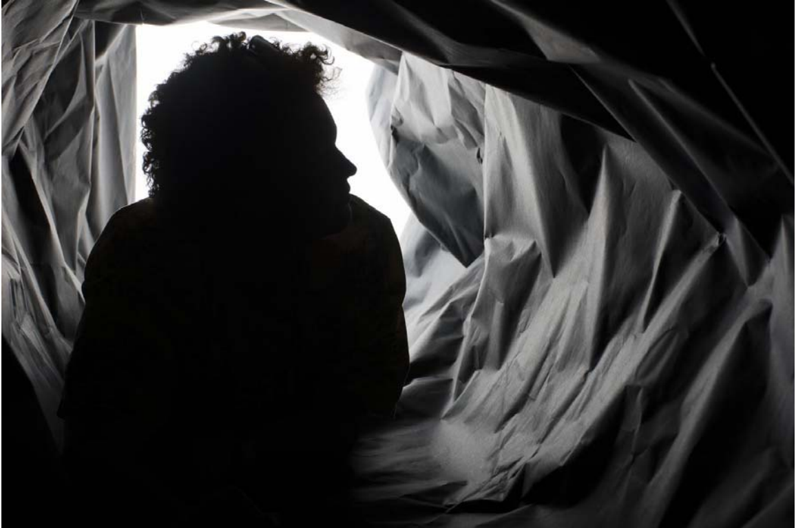
Untitled Film Still #9

Film Still #9 was an experiment with discarded background paper. I realized that the paper was wide enough to make a tunnel out of so I gave it a try. To give it a more dramatic feel I decided to crumble the paper and give it more texture and to backlight the scene. I was ecstatic with the way it turned out. It reminds me very much of a Tim Burton Stop motion film because of the mysterious and dark feeling it gives me.