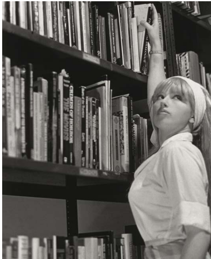
Cindy Sherman Untitled Film Still #13 1978

Technically, it is also a great image. The shadow is defined well on the white wall hinting at the use of a hard, small light source. In black and white image making it is extremely important to have contrast in lighting values to define and draw out the subject. Sherman uses this technique here with her wardrobe and lighting choice. This also has the effect of accentuating the effect of there being two people in the photograph. The inclusion of the traditional subject and the shadow provides context and contrast as masculine and feminine subjects and commentary on their relationship.