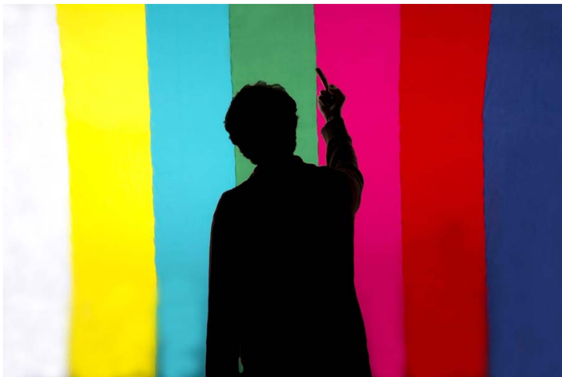
Untitled Film Still #27

The idea for # 5,6, and 27 came from when the TV in my house stopped working and the color bars were showing for a moment. I thought that it would look interesting if there were people stuck in the screen trapped. The color bars for me are a symbol of the media and I think that many of us can get sucked into our screens. In order to execute my idea, I bought pieces of fleece, cut them into strips and glued them together. It was probably the most work i'd put into a shoot but, it was worth it when I saw the results.