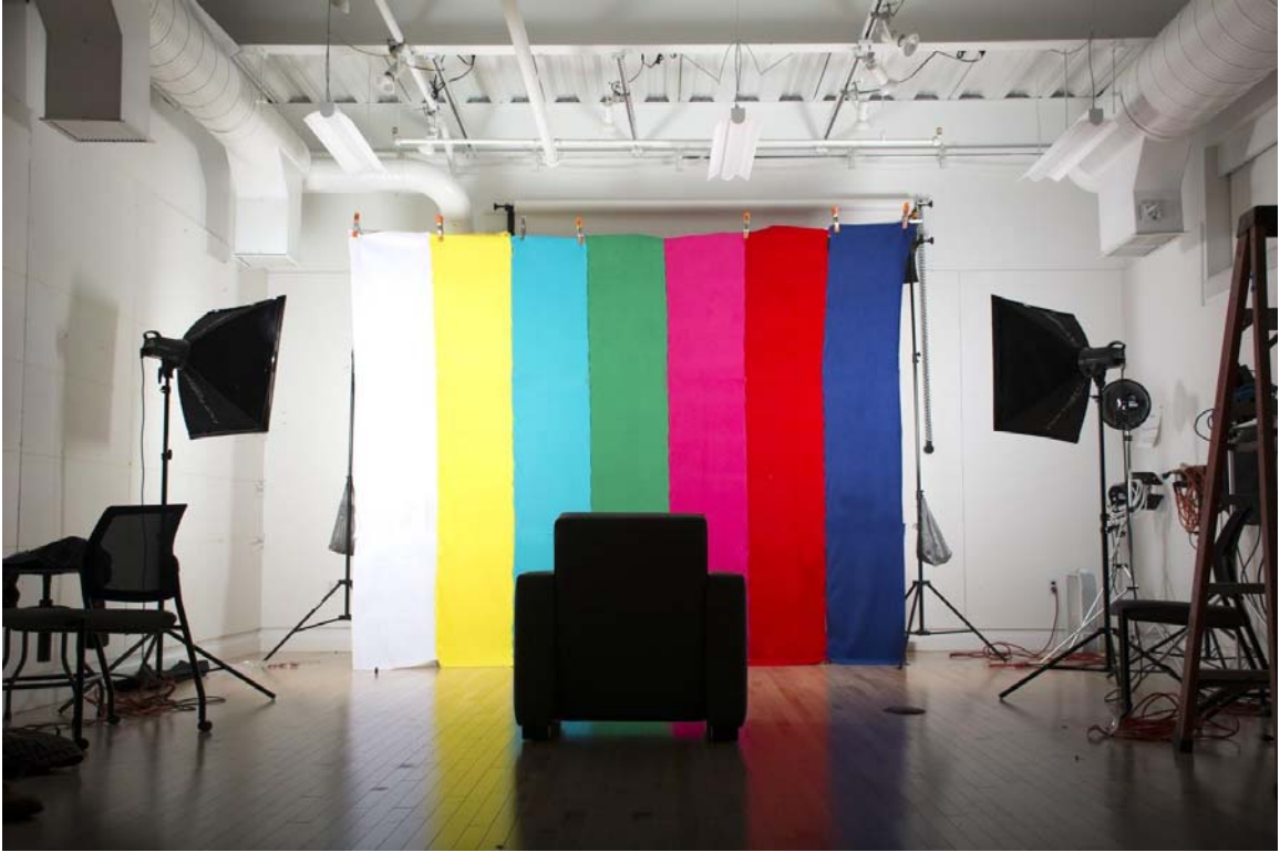
Untitled Film Still #5