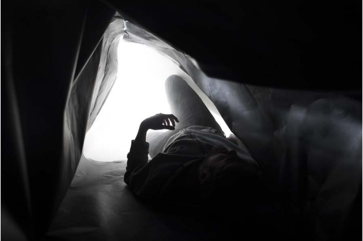
Untitled Film Still #10

I eventually revisited the idea of making paper tunnels. Instead of crumbling the paper I left it untouched and used it its natural form. This tunnel, unlike the last, was half white and half black. With the use of canned fog, I could make part of his body disappear. It gives a between life and death or heaven and hell feel to the image.