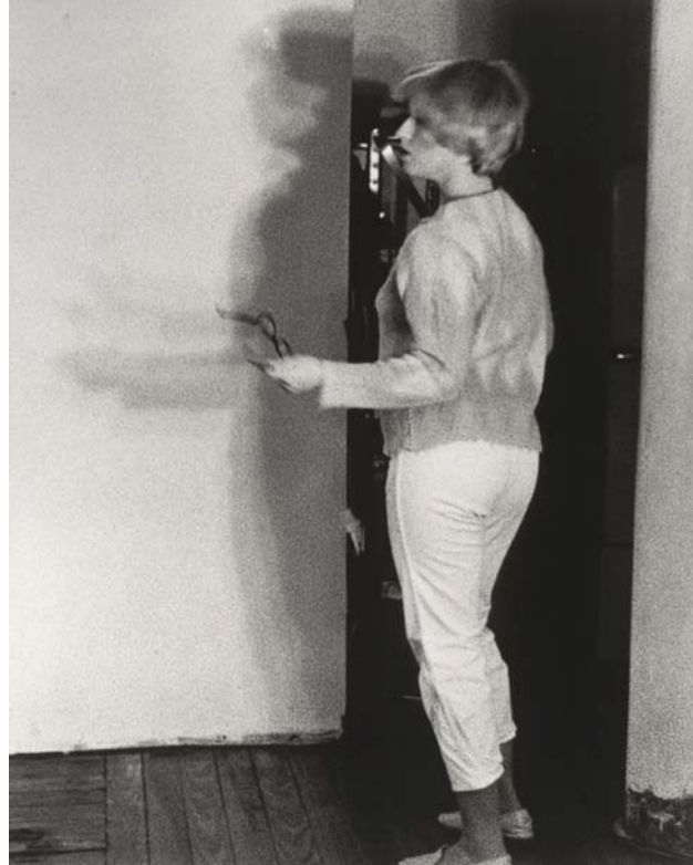
Cindy Sherman Untitled Film Still #1 1977

The first photograph in Cindy Sherman's Untitled Film Still project, Untitled Film Still #1 , can be deceiving at first glance. The image shows a person holding an object in their hand with their shadow cast on a white wall behind them. The shadow, if viewed alone, resembles a man in a top hat holding a pistol but, we can see that the subject is a woman with short hair holding a pair of glasses. The posture of the subject, level-footed, arm bent at ninety degrees, and a stern look on her face, gives the woman a powerful appearance. She looks alert and ready for whatever may be beyond the left side of the frame. This portrayal of power is stereotypically limited to the portrayal of men in film so it is fitting what Sherman has done with this image, highlighting the contrast of masculine and feminine representation in media.