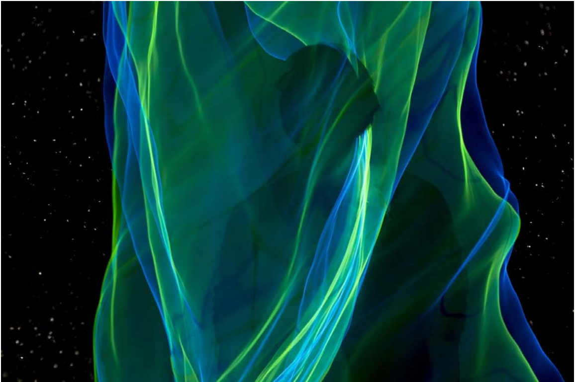
Untitled Film Still #25

This film still is the only composite image of the group. It was the result of experimenting with EL (Electroluminescent) wire and attempting to recreate the stars and solar system. The center colored portion of the image is a long exposure of EL wire as it is twirled around the subject. The outside of the frame is a shot of paper towel dust on a sheet of glass. I got this idea from Joey Shank's Shanks FX channel on YouTube. Inspired by Crewdson's images of people in tractor beams, I wanted to create an image of an alien appearing.