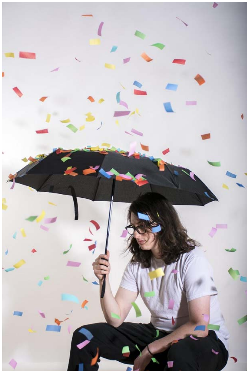
Untitled Film Still #11