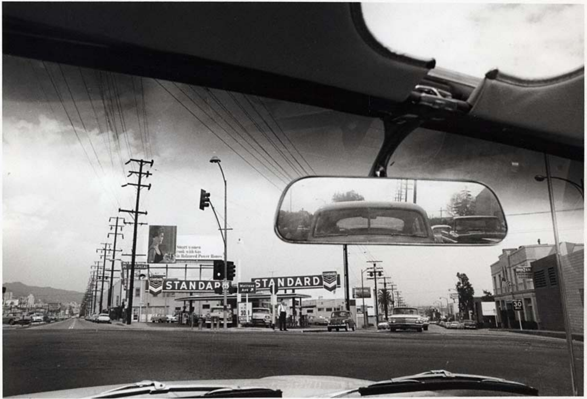
Dennis Hopper Double Standard 1961

Rider (1969). The film was a commercial and artistic success which won him the Cannes award for the new director category (Hopper Art Trust).