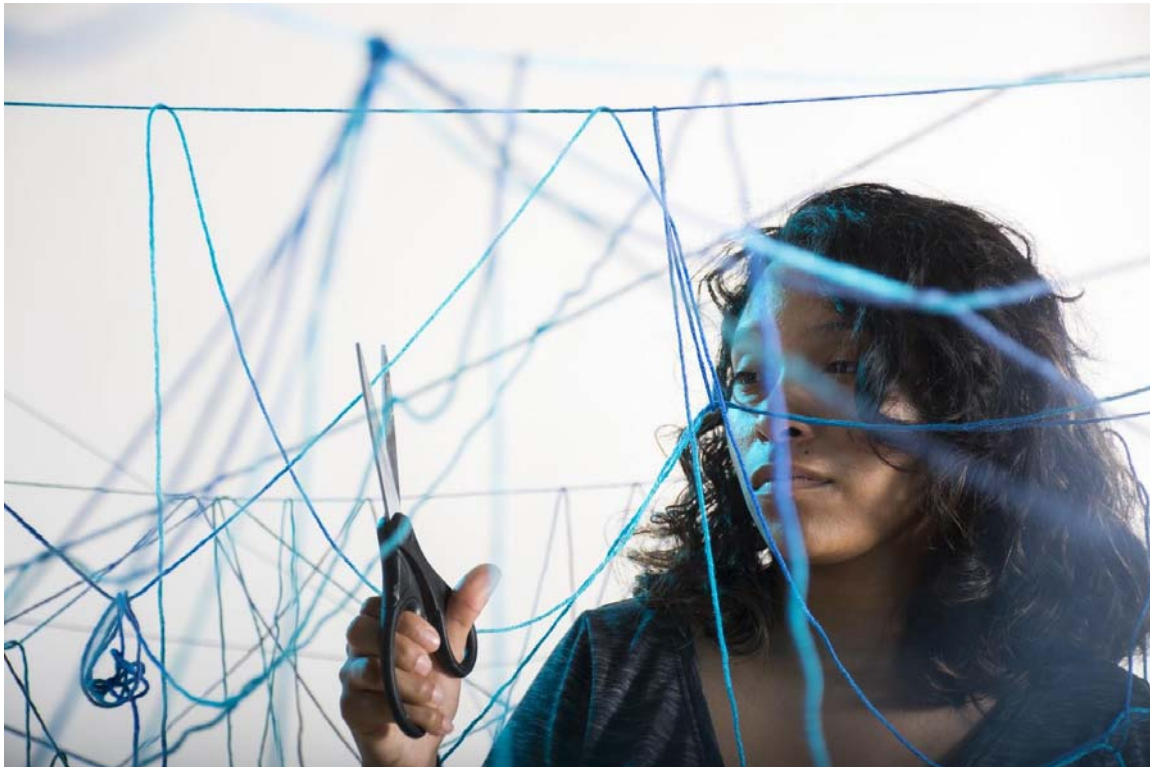
Untitled Film Still #14

Film stills #13 and 14 were also attempts to capture a feeling of depression, isolation, and despair. I thought that for this emotion it would be fitting for the subject to be trapped in a mess of blue string. In #14 I gave the subject a pair of scissors and asked her to try to cut herself out of the mess.