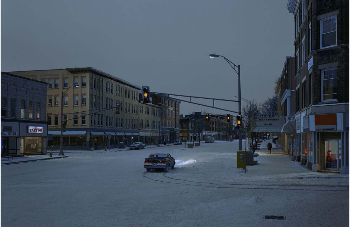
Gregory Crewdson Untitled from Beneath the Roses , 2006

them together. The color tones are typically dark or cool but, also have hints of warm tones, bright colors, and complementary colors.