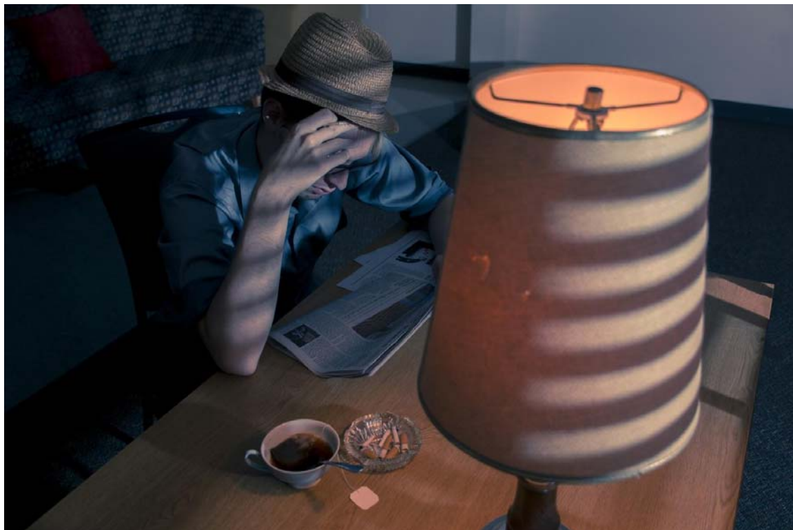
Untitled Film Still #1