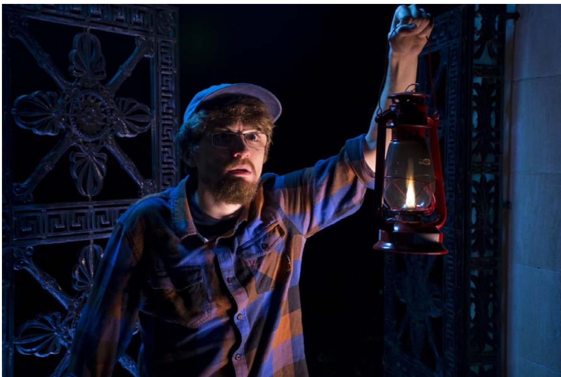
Untitled Film Still #4

and the corner formed by the floor points toward the subjects head. I think this has a nice effect of leading the viewer's eye to the subject.