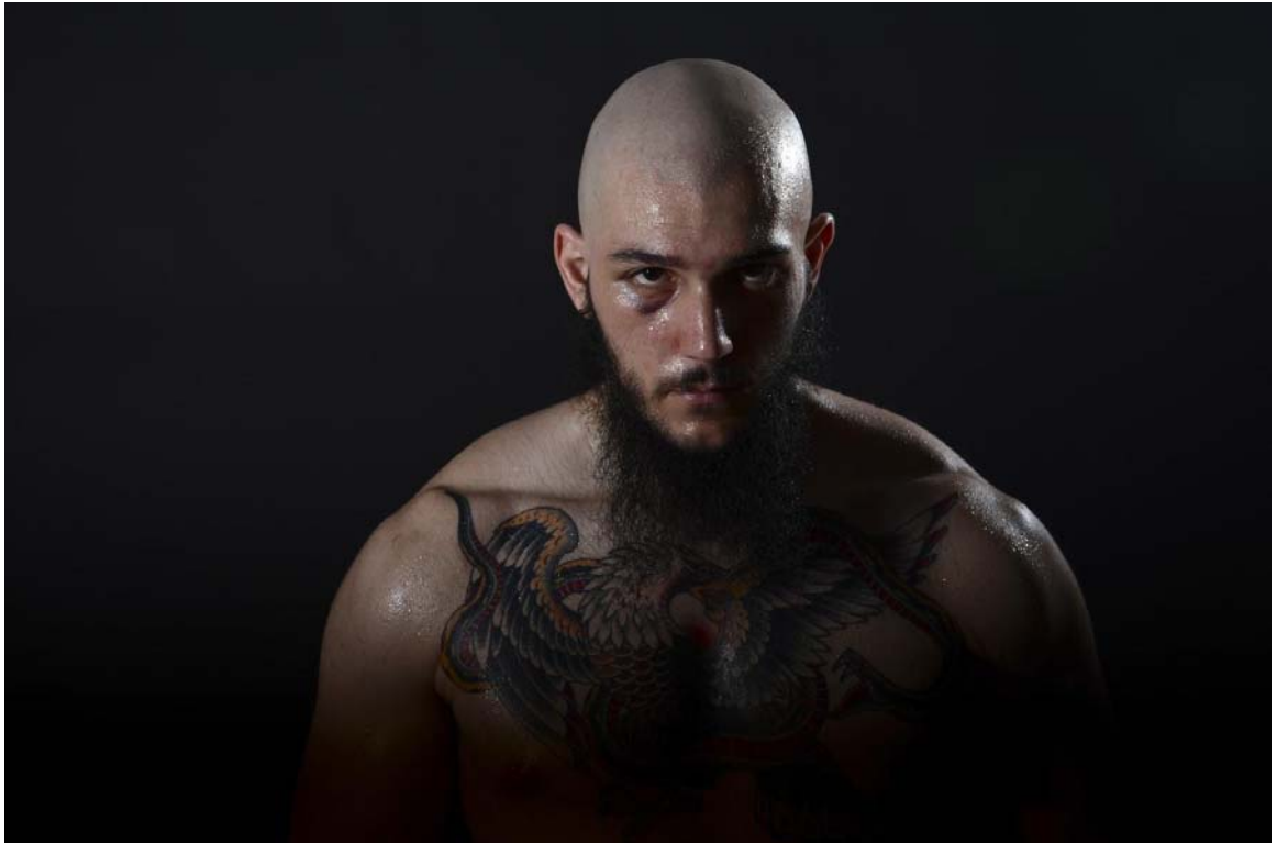
Untitled Film Still #21

with soft light, to look like the movie, I bounced the light from a strobe off of a circular reflector. To further the reference, I had my subject hold a toy gun and look unphased while about to shoot someone. I composed him on the left third with the gun on the lower right third and I used a low angle to make the subject seem even more menacing and powerful. I really like how the highlights on the hand look to give him an aggressive look.