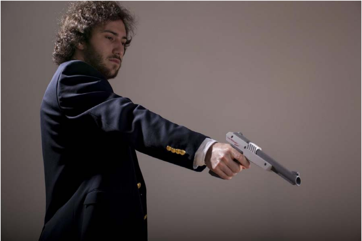
Untitled Film Still #19

The beginning of my film stills project entailed a process of learning to analyze lighting setups from films that I liked. In one of the first attempts, Untitled film still #19, I tried to create a look similar to the Tarantino film Pulp Fiction . By looking at the interior shots from the film I noticed that there seemed to be a hard light coming from above pointing down. This was deduced by looking at the highlights on the hair and hands of the characters. Additionally, I could tell that the lights used in the film were “hard” lights because they casted harsh shadows on the face and hands of the characters so I used a studio strobe without the softbox. To fill in the shadows a bit and brighten up the face