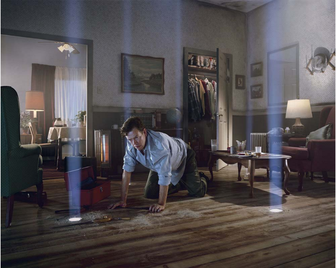
Gregory Crewdson Untitled (Dylan on the floor) 2001

“Untitled” (Dylan on the floor), 2001 is another stunning photograph by Crewdson. Besides the beautiful lighting in this image what stands out to me is the story that can be told. We immediately see the man in distress on his knees with an untucked and wrinkled shirt. His sweaty face looks crazed, afraid, and exhausted. He looks as though he has been trying to reach something that is beneath the floorboards, using a handsaw to cut holes into the floor. The image reminds me of the short story Tell-Tale Heart by Edgar Allan Poe in which a man goes crazy after hiding a body under the floorboards of his house. The interesting thing about this image is that it has you as the viewer