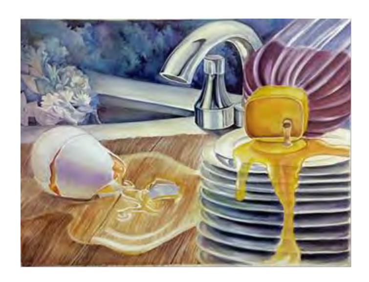
Fig. 12 Yi Ting Paung, Combined Objects Painting , 2017, watercolor, color pencil, and pastel, 19.8 in x 27.7 in.

complicated as the ceiling of the Vatican, or as simple as an enlarged image of a broken egg. This inspired me to collect ordinary objects in everyday life and draw them. I then combined all the objects I had drawn during this series of study. (Fig. 12)