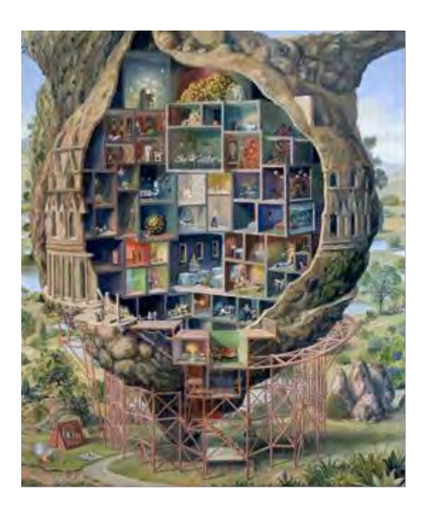
Fig. 7 Julie Heffernan, Self Portrait of Broken Home, 2008, oil on canvas, 67 in x 57 in.

Her creation of surreal natural landscapes incorporates human constructions that invite us to witness the drama unfolding in this dreamlike world as they fall out of balance. From studying her work, I am fascinated with the power of contrast in painting. Her excellent use of contrasting colors to create mood and enhance the visual sensation of the painting is extraordinary. Her painting is a visual expression of a fantasy story.