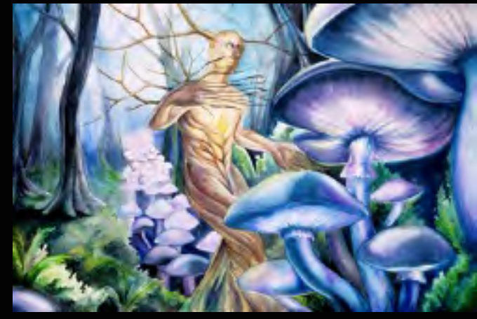
Surrelism: Art of Subconcious