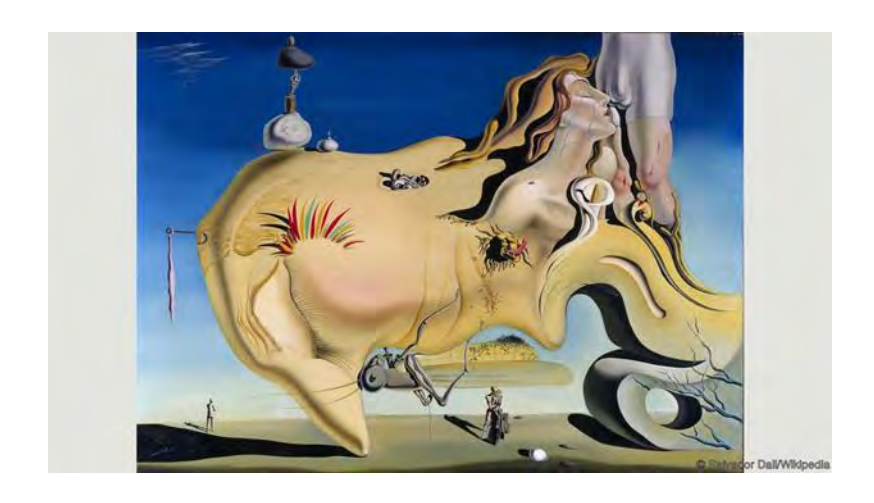
Fig. 5 Salvador Dali, The Great Masturbator , 1929, oil on canvas, 43.3 in x 59.1 in.

Bosch's vision of hell established a new milestone in the artistic world and his work influenced many later surrealist artists. Salvador Dalí studied the works of Bosch, and recognized him as his predecessor. It has even been suggested that the unusual rock formation resembling a face in Dalí's famous painting, The Great Masturbator , of 1929 was inspired by a similar shape visible in the landscape in the left panel of The Garden of Earthly Delights (Sooke, 20).