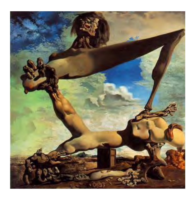
Fig. 1. Salvador Dali, Premonition of Civil War, 1936, oil on canvas, 39.31 in x 39.37 in.

meaning. This is when I was first introduced to surrealism. I still remember the first surrealist artwork I experienced, Dali's piece: Premonition of Civil War .