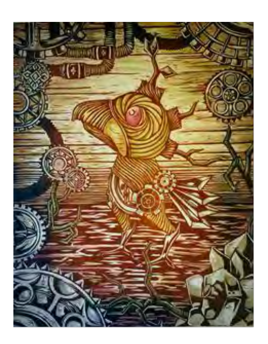
Fig.2 Yi Ting Paung, Puppet Show , 2013, watercolor and printmaking, 20 in x 16 in.

I furthered my relationship with surrealism in college. In my first printmaking class, I was able to explore ideas of automatic surrealism. Instead of giving my images a concrete meaning, I began to make obscure images with a vague or more abstract meaning; I started to illustrate the landscapes of my dreams, each image I created during the class had no firm particular meaning, but simply represented my subconscious mind. In this particular work, I illustrated a mechanical bird plodding along within a mechanical world.