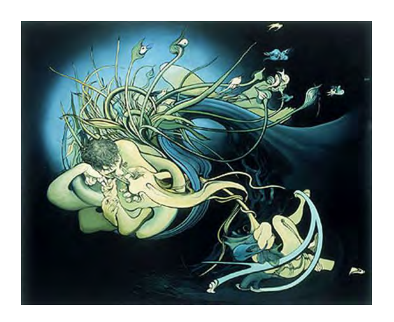
Fig.6 Inka Essenhigh, Romantic Painting, 2002, oil on panel, 52 in x 64 in.

Her excellent use of dramatic lighting and dynamic forms inspires me. In my thesis, I designed many dynamic forms using branches and smoke and placed them in a setting with dramatic light to create strong contrast.