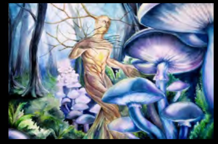
Surrelism: Art of Subconcious