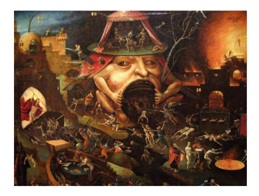
Fig 9. Hieronymus Bosch, Christ in Limbo, 1575, oil on wood, 22.9 in x 28.4 in.

With the inspiration of all the artists mentioned, I had started my thesis focused on surrealism. During my early works in thesis, I concentrated on studying the works of Hieronymus Bosch, Inka Essenhigh, and Julie Heffernan. In First Thesis Painting , I incorporated the creature in Bosch's vision of limbo from Limbo and the dynamic form from Romantic Painting (Fig. 6) created by Essenhigh. I set the combined creature in a dark forest to unify the different tones of the two objects and enhance the contrast between the darkness of the background with the brightness of the green form as a light source.