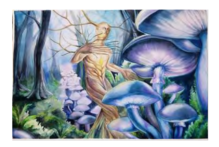
Fig. 10 Yi Ting Paung, Tree-man, 2016, watercolor, 12 in x 18 in.

shared one major flaw: the lack of a "real" element in the surreal world. To improve the "realness" of the make believe world, I studied real objects.