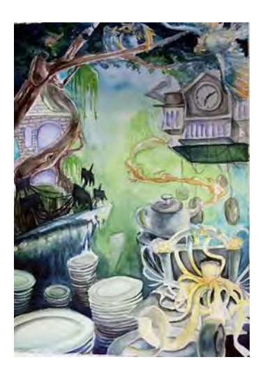
Fig. 13 Yi Ting Paung, Rough Draft for Final Project, watercolor, 9.9 in x 7.5 in.

final project, I created a life-sized watercolor painting. Below is the rough draft of this painting (Fig. 13).