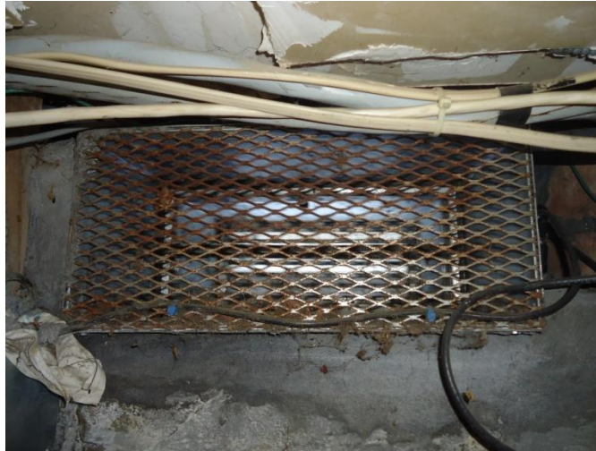
Figure 14. A vent in the basement which allows air to flow in from outside.

The 18 inch concrete foundation in Fero House has withstood the test of time very well. There are no apparent leaks to the outside in the foundation itself and no signs of flooding that are typically seen in older basements. There is however an opening installed in the boiler room which allows a large amount of outside air to flow directly into the basement (Figure 14).