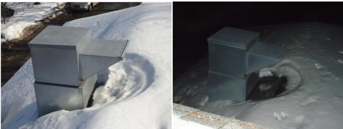
Figure 17. Image of vent being left on from the late afternoon (left) until night time (right) for one day.

This kitchen vent does its job well; the problem is that it is commonly left on when people are done cooking. This results in large quantities of warm air being sucked outside for no reason. While this could simply be remedied by a change in people's habits, Fero House's residents are very stubborn to change. Installation of a timer switch on this vent would allow people to still cook and then shut off the vent automatically after a maximum of fifteen minutes. For longer cook times, like when Fero House hosts dinners on Thursday nights, there is an option on this switch to keep the vent on until the user deems it time to turn off the vent. 30 Given the typical brevity with which meals are cooked in Fero House, the option to keep the fan on should not be consistently utilized. For only $19.50 this switch would save hours of unnecessary runtime by this vent which wastes electricity and removes a lot of warm air from the house, putting more strain on the heating system.