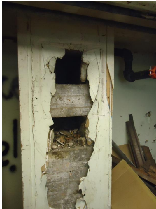
Figure 10. A large hole in the wall of the basement of Fero House.

In the basement there are noticeable damaged places that are allowing for large amounts of thermal bridging. Figure 10 shows such a place.