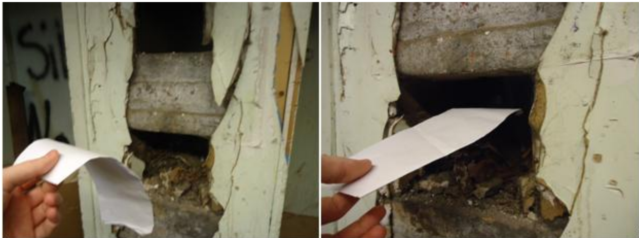
Figure 11. A hole in the basement wall of Fero House. The picture on the left shows a limp piece of paper. The picture on the right shows that same piece of paper being straightened out by an upward draft from the basement when it is placed inside the hole.

This hole only seems to be a problem for aesthetic and structural reasons, but as you can see in Figure 11, it also creates a major thermal bridge between the unconditioned basement and the rest of the house.