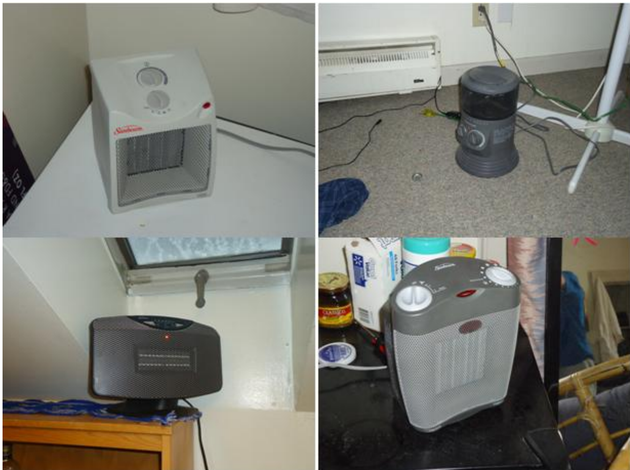
Figure 18. Electric space heaters used in various bedrooms around Fero House.

Due to the discontinuous nature of our heating system, especially during the end of the fall term and the beginning of the winter term when temperatures drop significantly, many of the residents of Fero House have invested in electronic space heaters (Figure 18). These are used primarily when our heat is not responding but also sometimes when the heat is active.