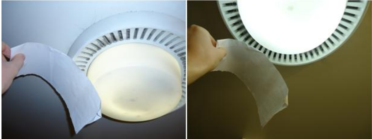
Figure 21. Picture of vents in the second floor (left) and third floor (right) bathrooms.

Keeping air quality high in a house also has a great deal to do with ACPH or Air Change per Hour, a measure of how many times the air within a house is replaced with fresh air. If ACPH is low, moisture can become trapped, allowing molds to feed and other allergens to build up. In Fero House, this is most noticeably a problem in the bathrooms where the vents have essentially stopped functioning (Figure V).