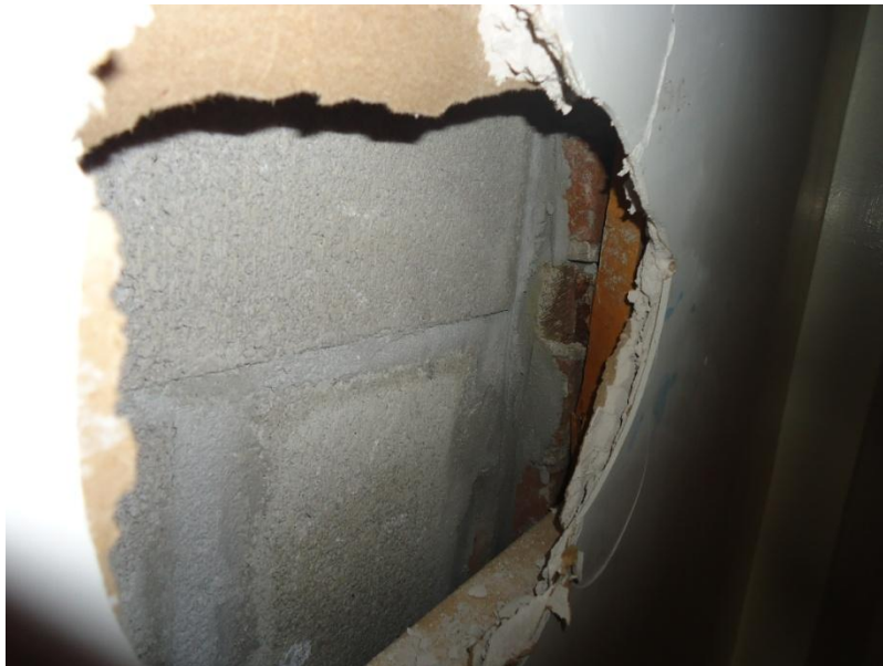
Figure 9. A hole made in one of the external walls on the 2 nd floor of Fero House during a party. It has since been fixed.

Unfortunately, Facilities at Union College were unable to provide me with an answer on exactly what Fero House's walls are composed of. From what could be deduced based on external and internal observations, as well as old renovation notes, the walls of Fero House are primarily built of concrete blocks and/or brick (Figure 9).