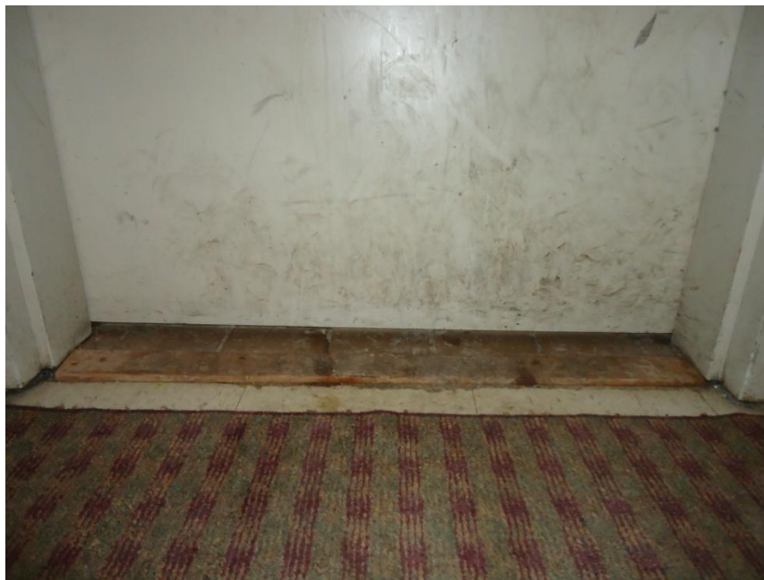
Figure 3. The base of the metal entryway door. A large gap is present between the floor and the base of the door.

Unfortunately, this metal door does not have a tight seal either, with a noticeable gap between the bottom of the door and the floor. This allows a large amount of cold air to enter the house and essentially takes away the benefits of the entryway (Figure 3).