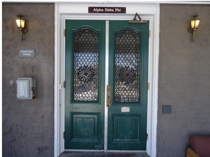
Figure 1. Front entry doors to Fero House.

Entering the front of Fero House you will notice an old wooden double door (Figure 1). Being constructed of solid wood it only offers an estimated R-value of 3.03, a dismal value when compared to a metal door with insulation or an EnergyStar fiberglass door. 8 While beautiful in its own craftsmanship this door has been through years of abuse and its flimsy construction is quite noticeable. This has led to a less than tight seal around the door, with noticeable drafts at the base of the doors and where the two doors meet. These gaps allow cold air to rush in from the outside, lowering the doors already small insulating value even further. While replacing this weathered wooden door with an EnergyStar fiberglass door would be ideal, it would also cost over a thousand dollars before the cost of installation, which, given the doors unique dimensions, would be quite costly as well. 9