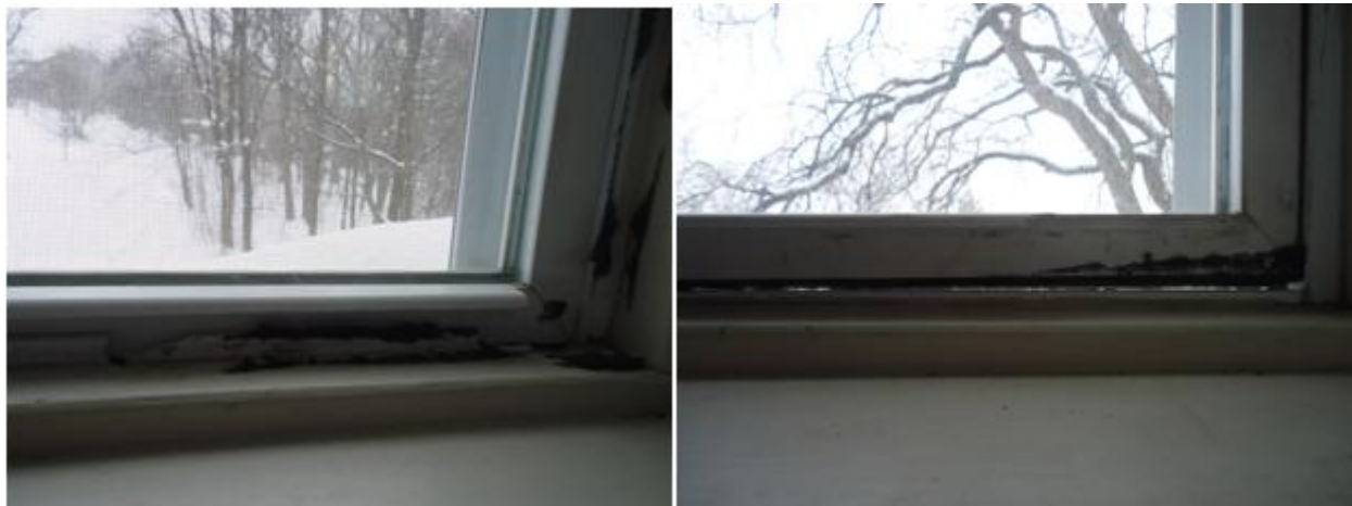
Figure 8. The window on the left has cracks in its frame, allowing cold air to seep in. The window on the right fails to close completely, creating a noticeable gap through which air can flow.

The rest of the windows in the house are double-paned, double-hung windows. They are all the same style, with larger ones on the first and second floors and smaller ones found on the third floor. Most of these windows are fine and do their job well, but a couple have grown leaky and imbalanced after years of use (Figure 8).