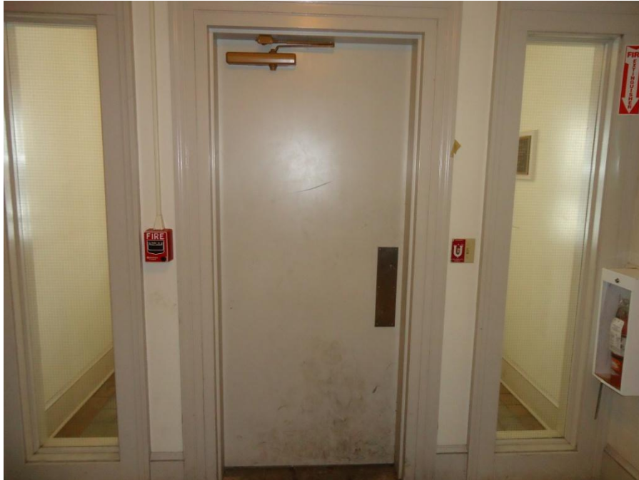
Figure 2. Metal door leading to the front entryway of Fero House.

Unfortunately, this metal door does not have a tight seal either, with a noticeable gap between the bottom of the door and the floor. This allows a large amount of cold air to enter the house and essentially takes away the benefits of the entryway (Figure 3).