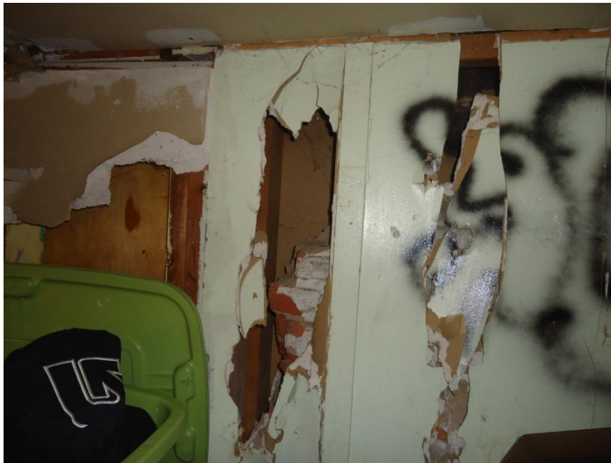
Figure 12. A large hole in the basement of Fero House.

A similar hole can be found in the same basement room in Fero House (Figure 12).