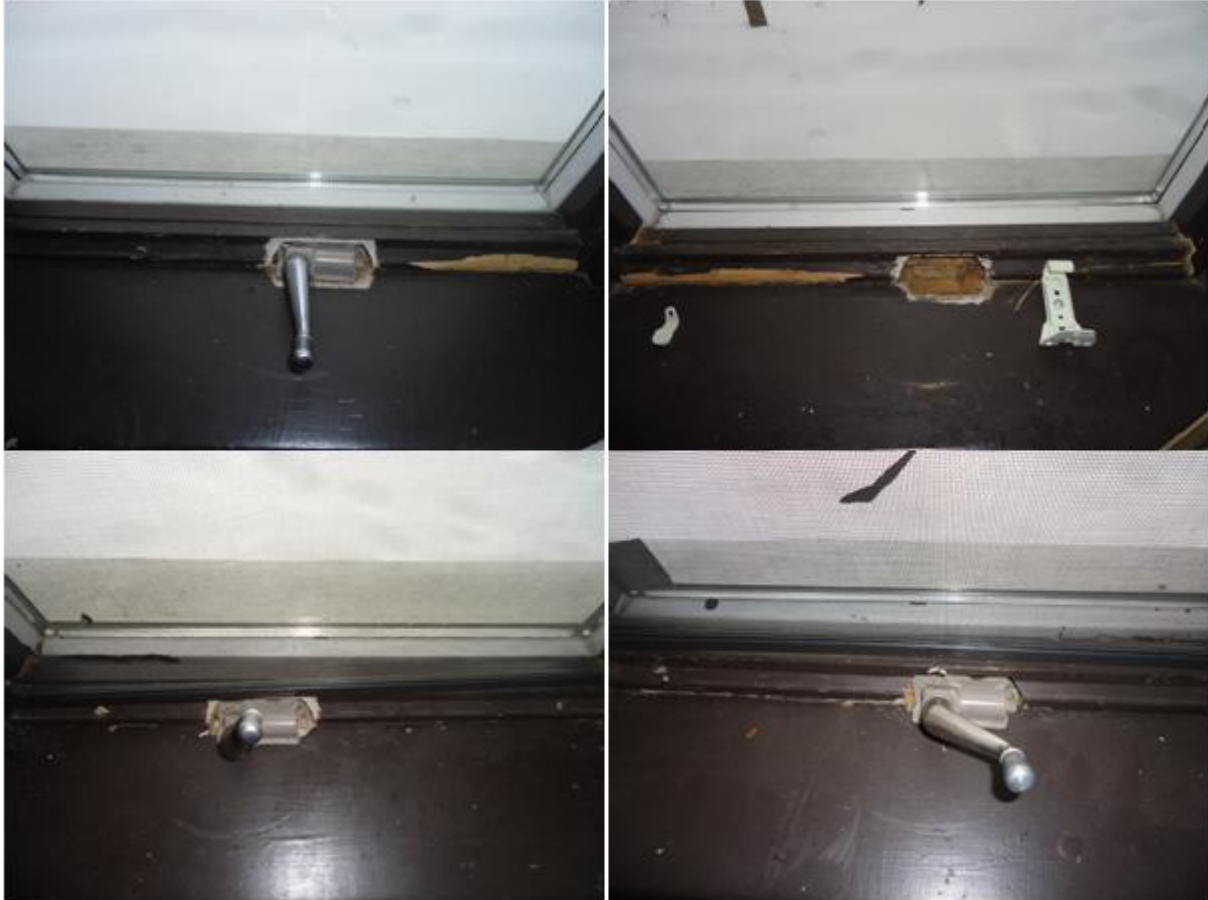
Figure 7. Defects along the frames of the south-facing windows in Fero House.

The areas around the cranks of the windows let in a noticeable draft when you put your hand up to them. Also, the cracks in the frames around the windows serve to let cold air seep in. While we could replace these windows with eight double low-e windows with a much higher solar heat gain, it would cost nearly $3,000 plus the cost of installation. 14 It appears to make much more economic sense to invest in fixing the areas around these windows than completely replacing them.