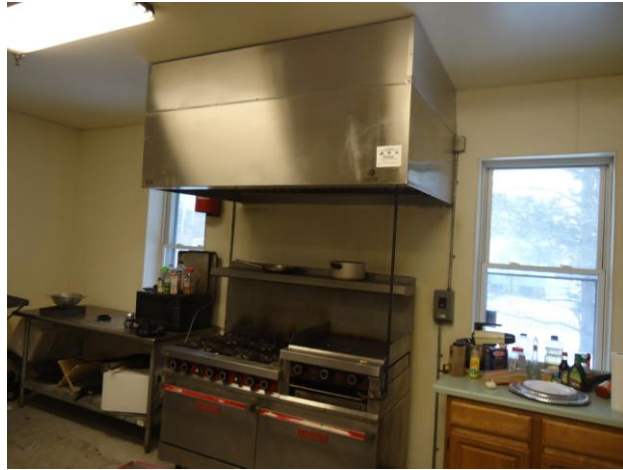
Figure 16. Hood vent above the stove in the kitchen of Fero House.

The hood above the stove in Fero House is meant to suck out the smoke and steam caused by cooking so the fire alarm does not go off (Figure 16).