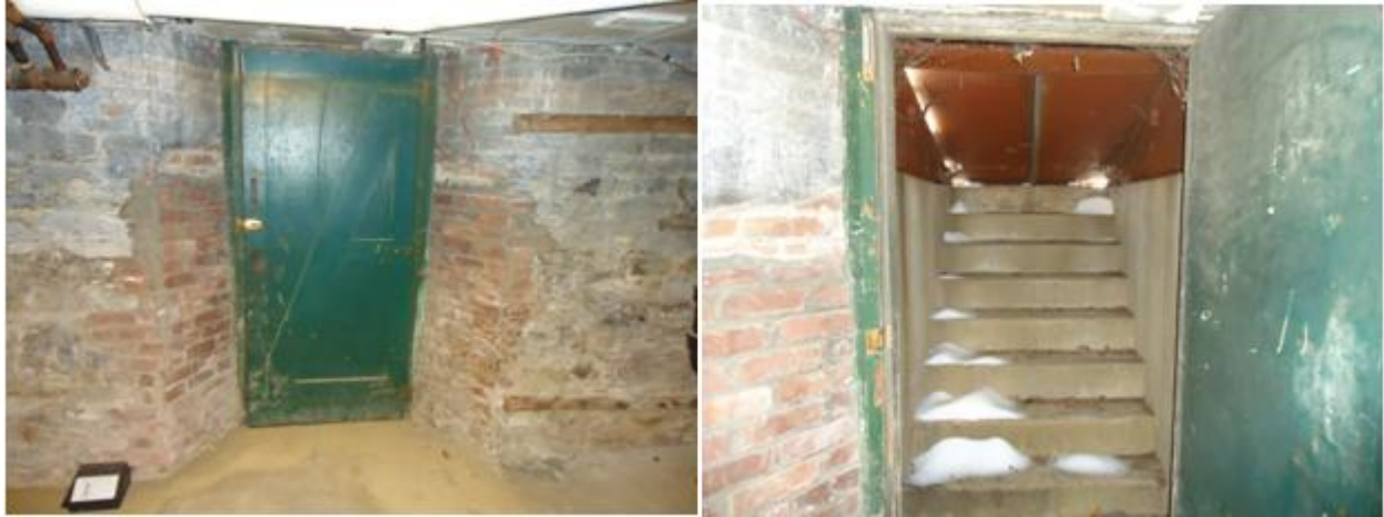
Figure 5. The picture on the left shows the basement door connected to the boiler room. The picture on the right shows that same door opened, revealing the metal access door which has allowed snow to seep in.

With this door a draft guard will only cover part of the problem and replacing the door will again be quite costly. This door is never used in the winter and only occasionally opened in the fall and spring terms. Considering the low frequency with which this door is used, a sealing tape would be an effective means of preventing drafts around the door in the winter and it can easily be removed if the door needs to be used in the warmer months. A 30ft roll of interior weather sealing tape only costs $4.06, 13 which is enough length to cover the entire frame of the door. Using the same assumptions used for the first floor doors, this tape will easily pay for itself in under a month's time.