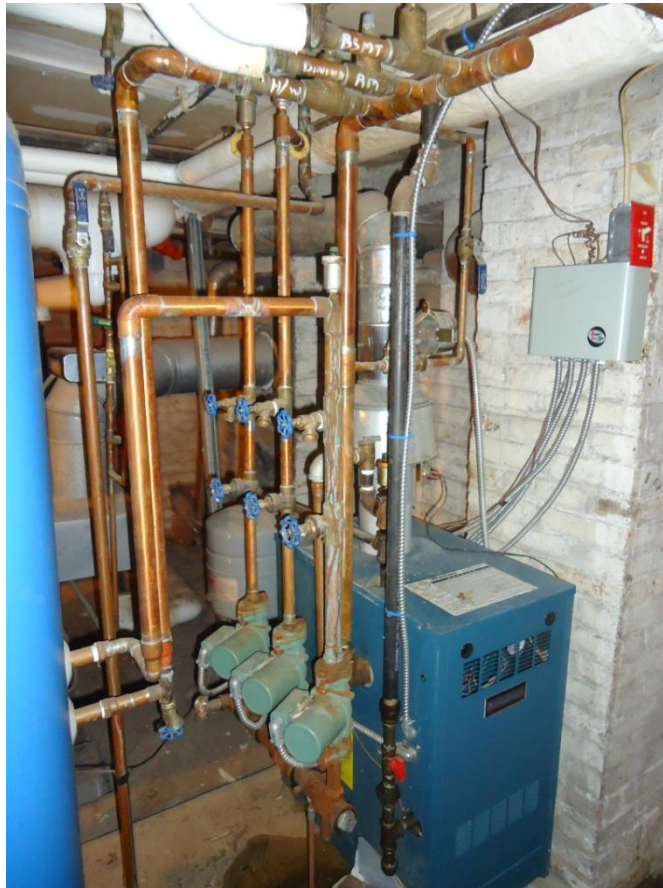
Figure 15. Un-insulated piping coming from the hot water boiler.

The hot water boiler efficiency could easily be improved through more pipe insulation. The pipes closest to the boilers themselves are left exposed which can result in unnecessary heat losses (Figure 15).