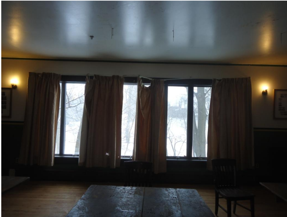
Figure 6. Eight casement-style south facing windows in the dining room of Fero House.

Immediately noticeable in the first floor dining area of Fero House is a large amount of tall, south-facing windows (Figure 6).