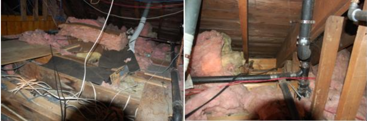
Figure 13. Insulation on the attic floor of Fero House.

The current third floor of Fero House used to be considered an attic according to the house's 1992 blueprints. These renovation blueprints also state that nine inches of fiberglass insulation with a radiant barrier was added to the actual attic floor. Upon inspecting the attic floor, I found this insulation to be less than well-installed (Figure 13).