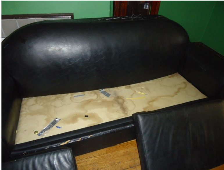
Figure 20. A couch found in the main living room of Fero House.

Air pollutants can also be held in old furniture, which is the only kind of furniture found in Fero House (Figure 20).