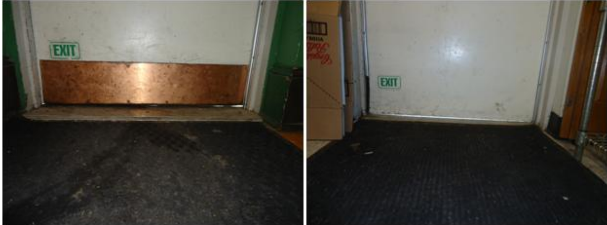
Figure 4. The door gap on the left allows cold air to seep directly into the dining room. The door gap on the right allows cold air to flow directly into the kitchen.

These cracks not only allow large amounts of cold air in, which wastes money on heating, but also drastically reduce the comfortable living conditions of these two rooms. While the dining room is often more bearable because it is connected to other heated areas, the kitchen is cut off from the rest of the house by two doors. This makes it near impossible to cook comfortably in the kitchen during the winter time and has helped create other problems such as the frozen pipes we experienced last winter.