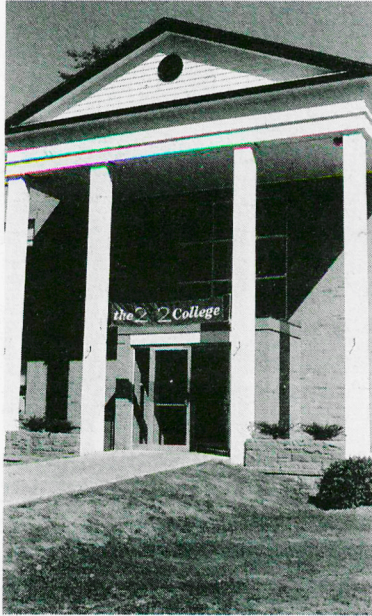
Paul Smith's College is increasing the size of its student body and investing several million dollars in new facilities.