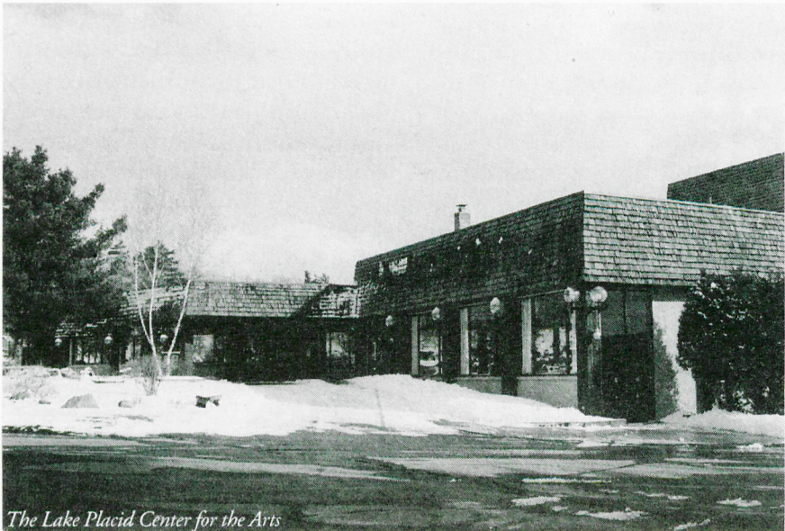
The Lake Placid Center for the Arts