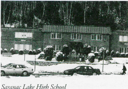
Saranac Lake High School