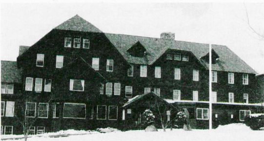
The Northwood School