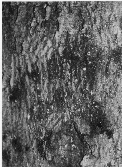
The symptoms of beech scale (white spots) and Nectria fruiting bodies (small brick-red spots) are seen here together along with the 'larry spots' indicative of the fungal infection.

Sage (1996) reported that BBD-induced mortality was greatest in trees with diameter at breast height (dbh) of 16 inches (41 cm) or greater, but that 90% of trees with dbh greater than 6 inches (15.2 cm) showed some evidence of disease. In a continuation of that research, McNulty and Masters (2005) observed an increased infestation of the scale insect and/or the fungus on smaller beech since 1989. In order to project the impacts of BBD into the future, scientists will need to know how the populations of disease-causing agents are responding to changes in size of available host trees.