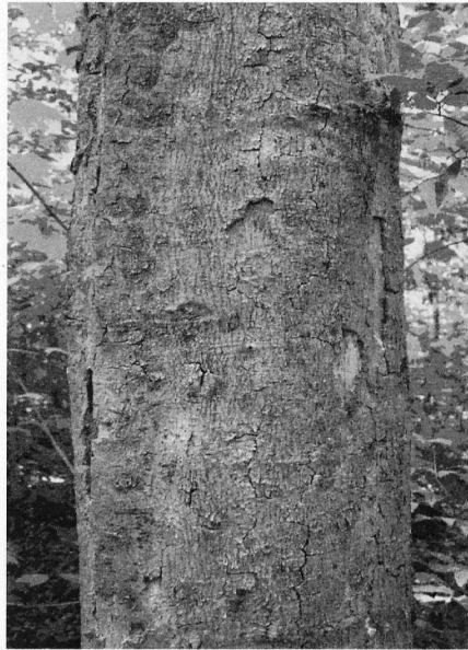
This standing dead beech shows heavy evidence of historical Nectria fungus damage.

Managers are extremely challenged by the persistence of the disease and have little scientific information regarding the current status of the disease complex that will aid in building management strategies for the future. Beech is a desirable species in that it provides the primary source of hard mast in the northern hardwood forest. It has often been discriminated against by managers focused on timber value, because it is slow growing, is hard to dry for lumber, and takes up considerable growing space while shading out more valuable timber trees. At first, shortsighted managers thought BBD would solve their "beech problem"