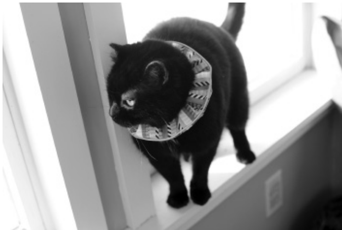
Figure 1: The author's cat models the Birdsbesafe® cat collar cover.

So how does all of this relate to an anti-predator device like the Birdsbesafe® cat collar cover? Our north temperate birds act more like tropical and lower latitude birds only once they have completed breeding; they relax. Under this hypothesis, we would never expect the spectacular difference in effectiveness of the CC found in our New York study for lower latitude birds, because they are not as distracted by surging levels of testosterone. They are more vigilant and better at noticing cats creeping up on them, even in the breeding season. What this suggests for owners of cats in the Adirondack region, the northeastern United States, and really anywhere at higher latitudes is that these regions are the places where this anti-predator device will be most useful. Specifically, for owners who choose to use it, it is critical to use the device in the passerine breeding season from mid-spring through mid-summer. As northeast songbirds continue to decline due to a myriad of affronts including habitat alteration, climate change, window, building and wind-turbine strikes, as well as domestic cat predation, bird lovers who are also cat lovers with outside cats need to understand they have a responsibility to their backyard birds. Of course it is best to keep domestic cats inside (see American Bird Conservancy 2015), but if circumstances do not allow this, the Birdsbesafe® cat collar cover is a very effective alternative for decreasing songbird predation.