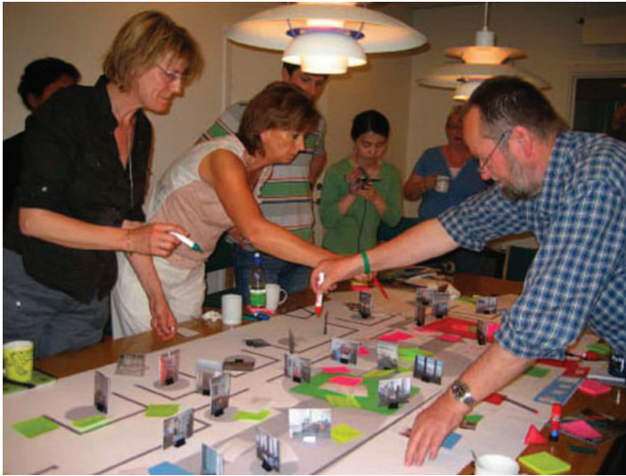
Figure 6. The last Office Design:Lab session, participants discussed the office from the point of view of the rhythm and pace of activities. This led to small full-scale experiments, where zones and places in the office were made more visible.

engineering consultants in committed dialogues with factory workers along the lines laid out in the Factory Design:Lab.