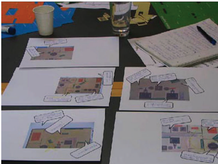
Figure 4. After the layout proposal by the operators had been recreated by the participants of the Factory Design:Lab, the suggestion was literally cut in pieces and annotated with the participants’ comments.

In another case, the Office Design:Lab collaboration was established with a municipal office. The office had recently moved to a temporary open office space to implement a new organisation of work. The office would move to a refurbished office building within one or