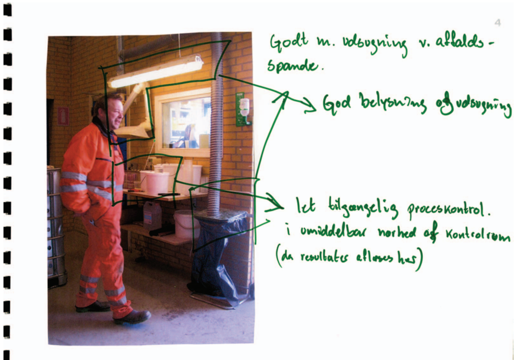
Figure 2. The operators made a workbook where they selected and commented upon photos from the plant. Green marked things worth keeping (as seen here).