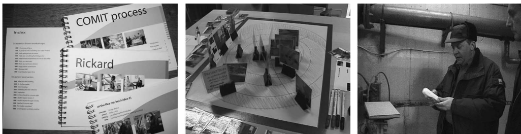
Figure 1. At the Interactive Institute in Malmö, we worked with open formats for representing design ideas in co-design sessions.

We learned that the success of the participatory design research is dependent on all partners putting something at stake in the process. Only if the partners experience that they have put something into the collaboration for which they are accountable, and that what is taken up touches issues essential for them, will they become full participants. This commitment is necessary to ensure that what is produced is processed and reflected upon not only by the research team but also by the other participants. When this condition was met we could go through a full circle of inquiry to reach an acceptable level of closure.