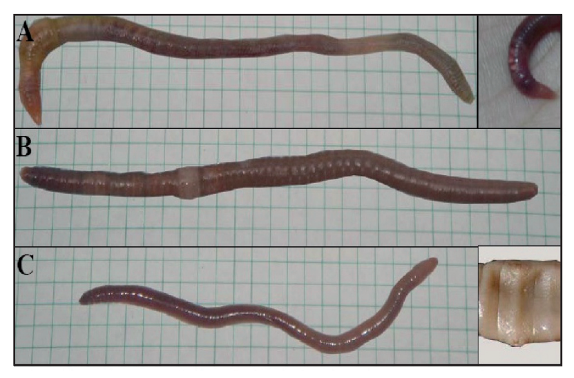
Figure 2. Earthworm species found in 15% slope: (A) Pontoscolex corethrurus ; (B) Metaphire spp.; (C) Pithemera bicincta