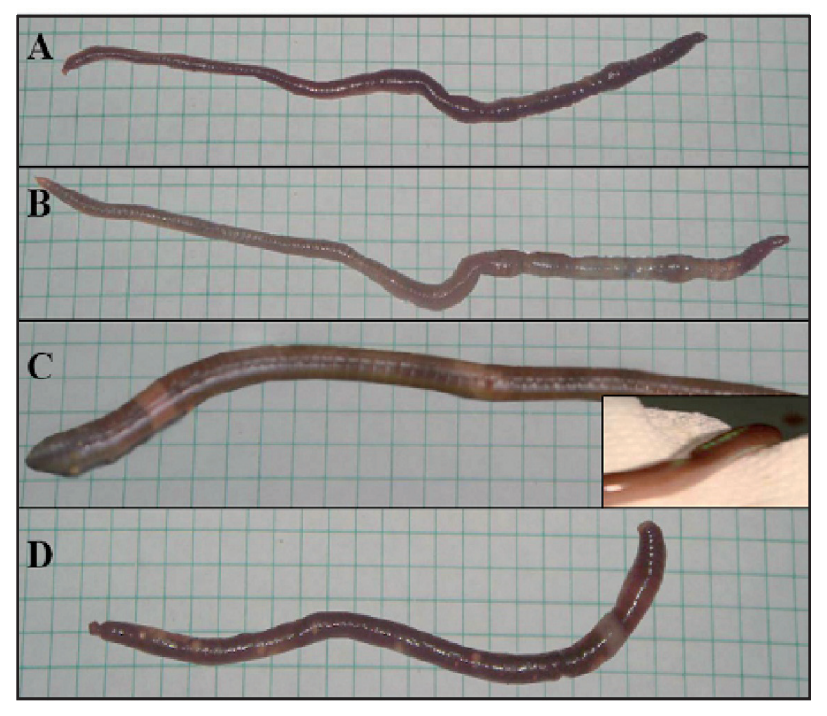
Figure 3. Earthworm species in 25% slope: (A) Perionyx excavatus , ventral side; (B) Perionyx excavatus , dorsal side; (C) Metaphire inflata cai ; (D) Metapheretima sp.