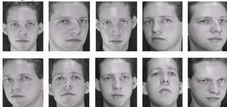
Figure 3. Images of one person in the ORL database

The standard database Olivetti Research Laboratory (ORL) [16] is selected to test recognition accuracy of the new proposed approach. In the ORL database, it has been approved that there are 10 dissimilar images for each of the 40 different themes. Differences in face expression are present (smile and/or non-smile face as well as open and/or close eyes), and face specifics such as wearing glasses and/ or no glasses on. Most of these pictures were taken against black standardized background with the subjects in frontal position and an up-right, all of these images are tolerance for some tilting's and revolutions of up to about 20^\circ . Figure (3) is a picture of a person shown in the database. Database are component from 400 face images. The resolution of all images is 112 \times 92 , and 8-bit grey levels.