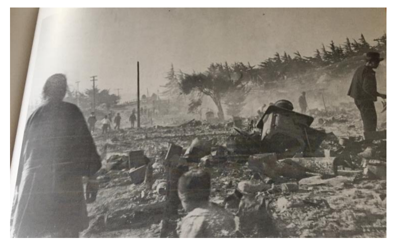
Burnt Point Alones Village, May 17, 1906. Chinese residents scramble to collect their belongings.

On May 16, 1906, a fire [of unknown origin] destroyed about two-thirds of the village, leaving only sixteen buildings. The Pacific Grove Review provided numerous theories about the fire, speculating that a carelessly discarded cigarette, arsonists, or inattentive Chinese burning garbage started the blaze. The Chinese themselves may have contributed to the disaster by building a flammable village of cramped wooden structures and fish-oil soaked drying racks. As the blaze engulfed the village, spectators lined the railroad tracks, while others looted the buildings that remained (Chiang, page 198). After this horrible incident, a fence was built around what used to be known the Point Alones village. The Chinese from that fishing village were not allowed to rebuild after the fire destroyed their homes. They were threatened by the guards, hired by the Pacific Improvement Company, if the Chinese ever tried to attract tourists and homebuyers to the area.