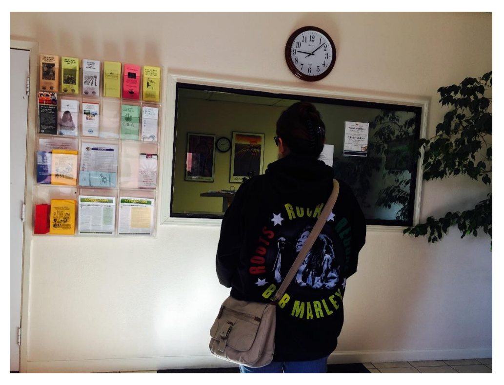
Photo of CRLA client waiting to be assisted in lobby.