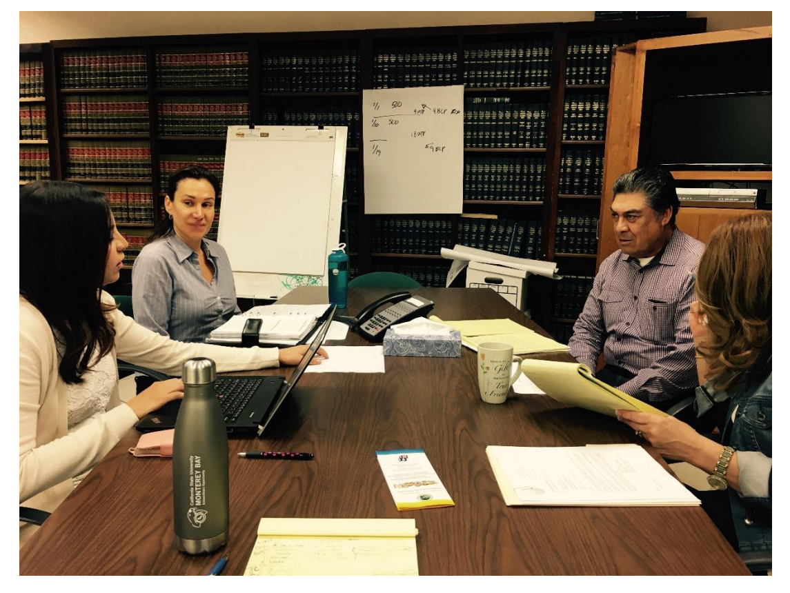
Photo of Attorneys discussing cases during case reviews.