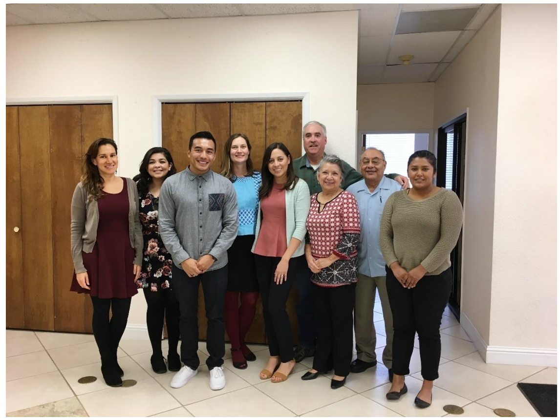
CRLA attorneys and Interns from California State University, Monterey Bay.

This is to all of the attorneys at California Rural Legal Assistance who fight to end injustices that migrant workers and others in the community face every day.