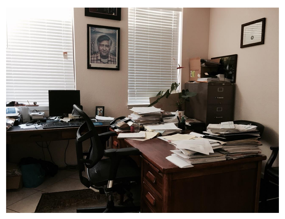
Office of CRLA Attorney.