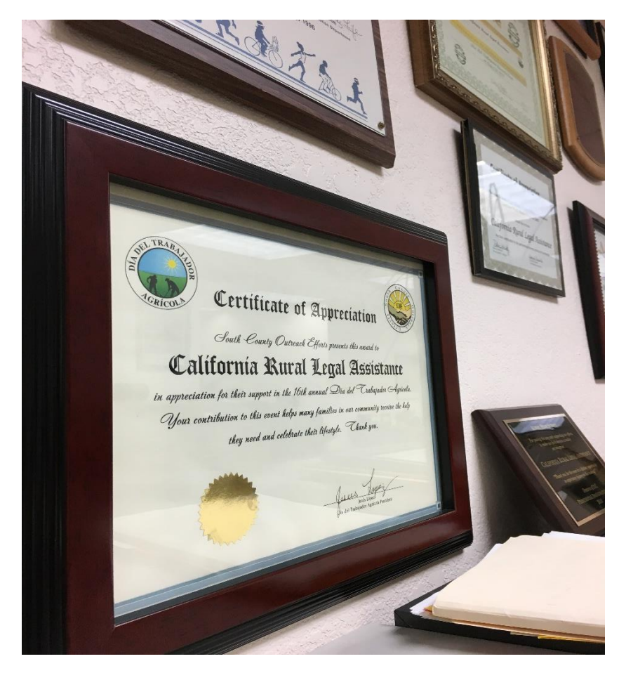
Certificate of Appreciation award given to CRLA.