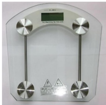
Figure 3: Glass Digital Personal Scale

The digital weighing scale is a 6mm tempered safety glass platform, auto zero resetting and auto off. It contains a low power and overload indicator. The maximum load capacity of the scale is 180kg and is powered by a cell battery.