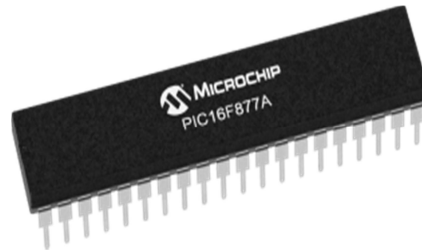
Figure 4: The PIC16F877A microcontroller

program and data memory for storage. The microchip is powered by a 5 V DC supply. The microchip was programmed using C programming language through an Arduino board.