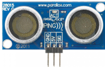
Figure 2: Parallax PING))) ultrasonic distance sensor

The digital weighing scale is a 6mm tempered safety glass platform, auto zero resetting and auto off. It contains a low power and overload indicator. The maximum load capacity of the scale is 180kg and is powered by a cell battery.