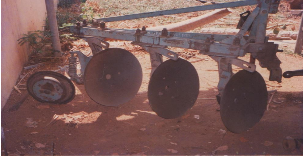
Fig. 2: NARDI ITALIA 3-Bottom Standard Disc Plough